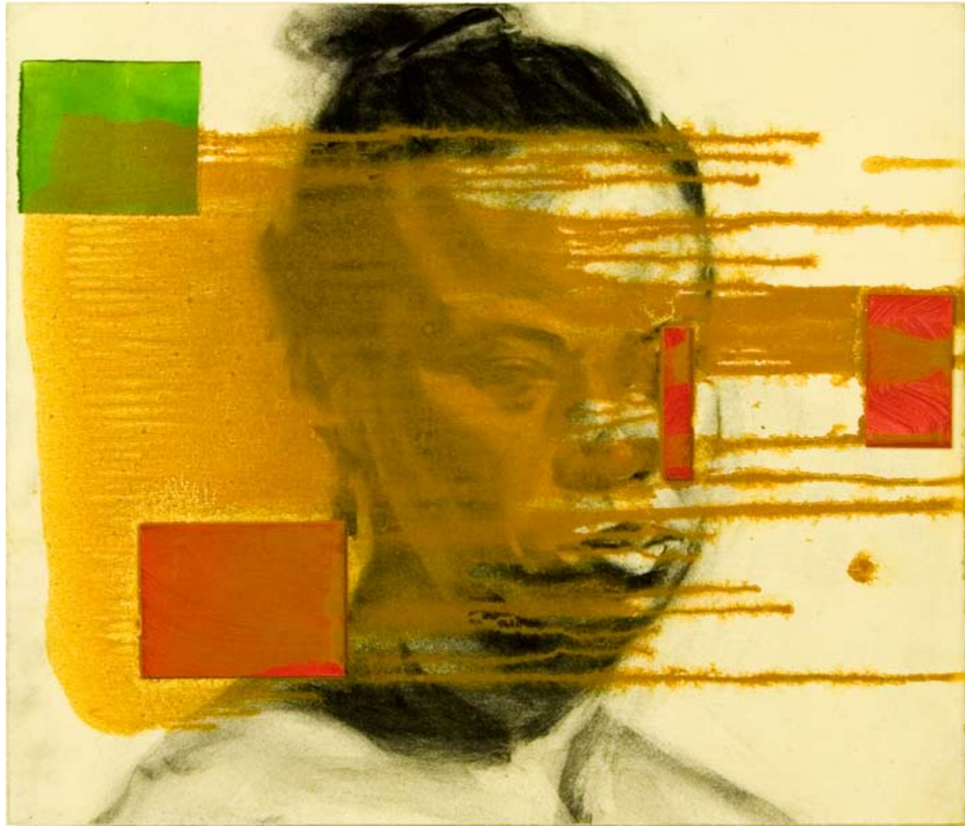
"Venus" , 2011 17.75" x 21.625" 45 x 54.9 cm charcoal, ink, acrylic, oil, museum-board and paper on wood panel