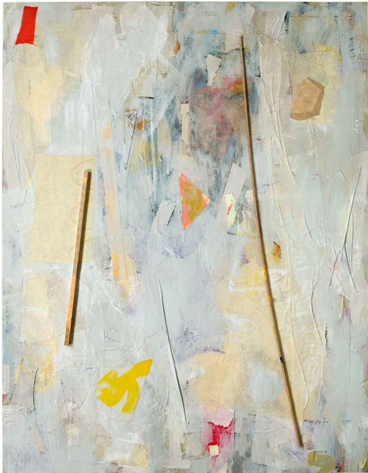
"Ecstasy" , 2010 54" x 42" 137.2 x 106.7 cm charcoal, ink, acrylic, rice paper, museum-board, silk, wood, linen, cotton gauze and paper on wood panel