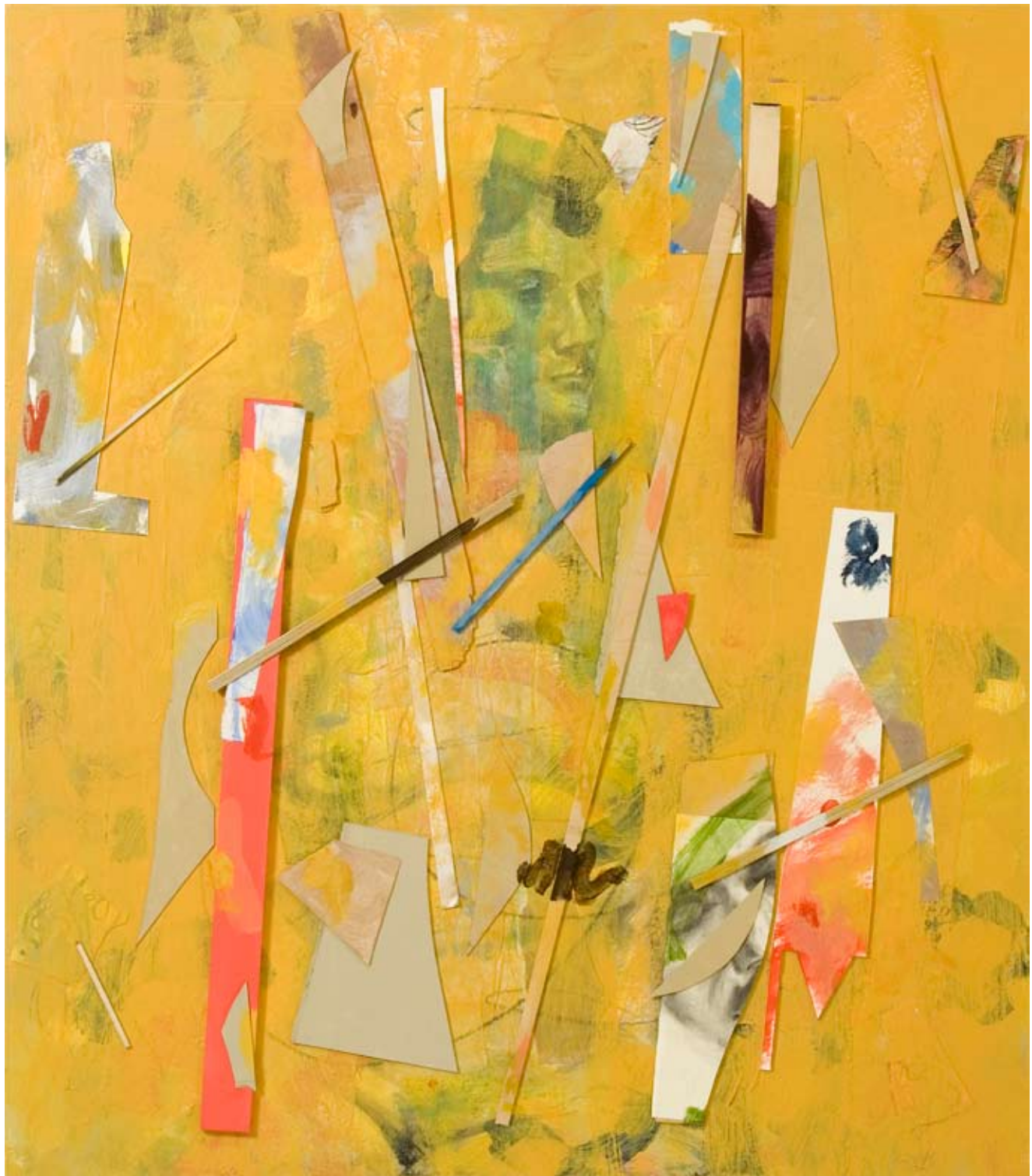
"Beauty's Beast", 2011 48" X 42" 121.9 x 106.6 cm charcoal, graphite, ink, acrylic, rice paper, paper wood, and museum-board on wood panel