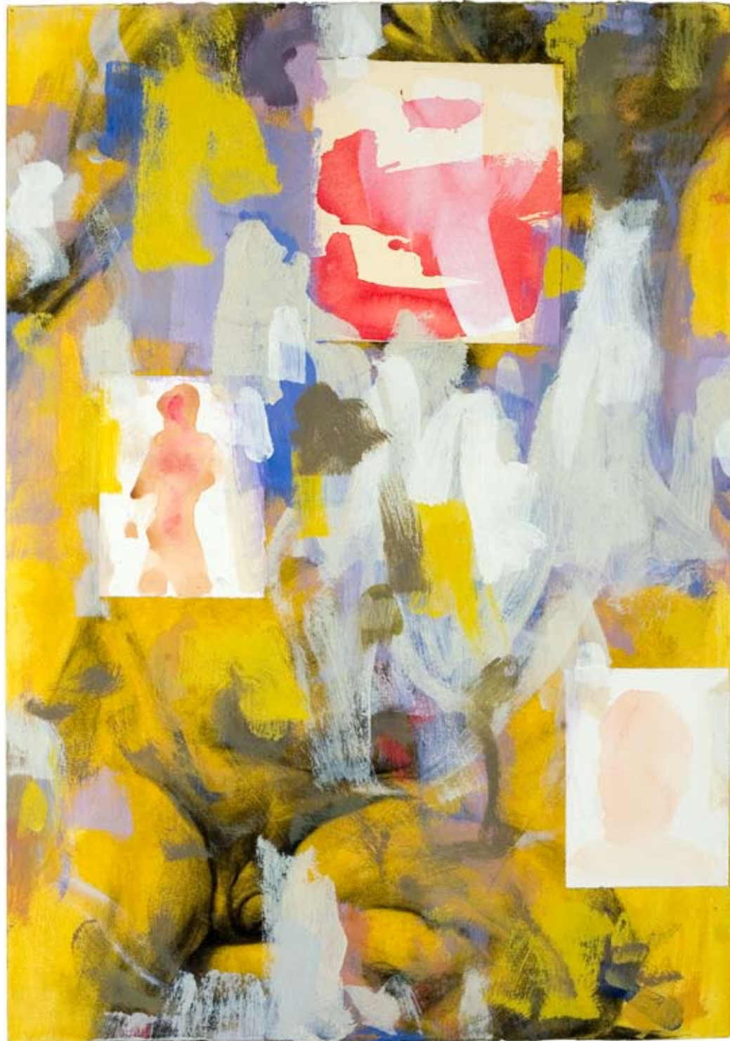
"Yellowmon", 2010 35.5" X 24.75" 90.2 x 62.8 cm charcoal, ink, acrylic and paper on wood panel