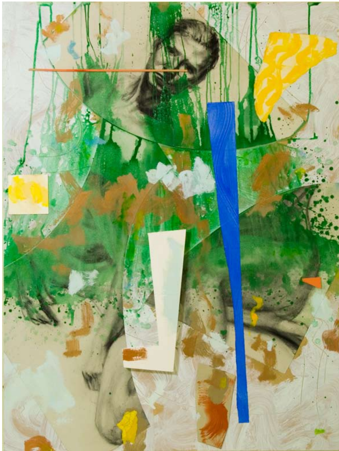
"Donna d'Oro", 2011 56" x 42" 142.2 x 106.6 cm charcoal, graphite, ink, acrylic, wood, tycore panel, museum-board and paper on wood panel