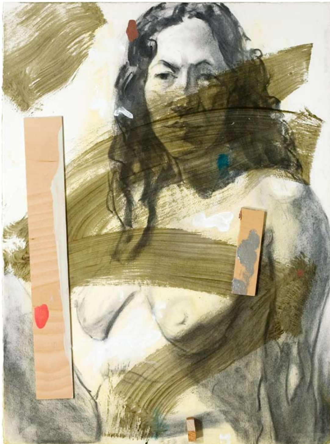
"Odalisque" , 2010 30" x 22.25" 67.2 x 56.5 cm charcoal, acrylic, wood and paper on wood panel