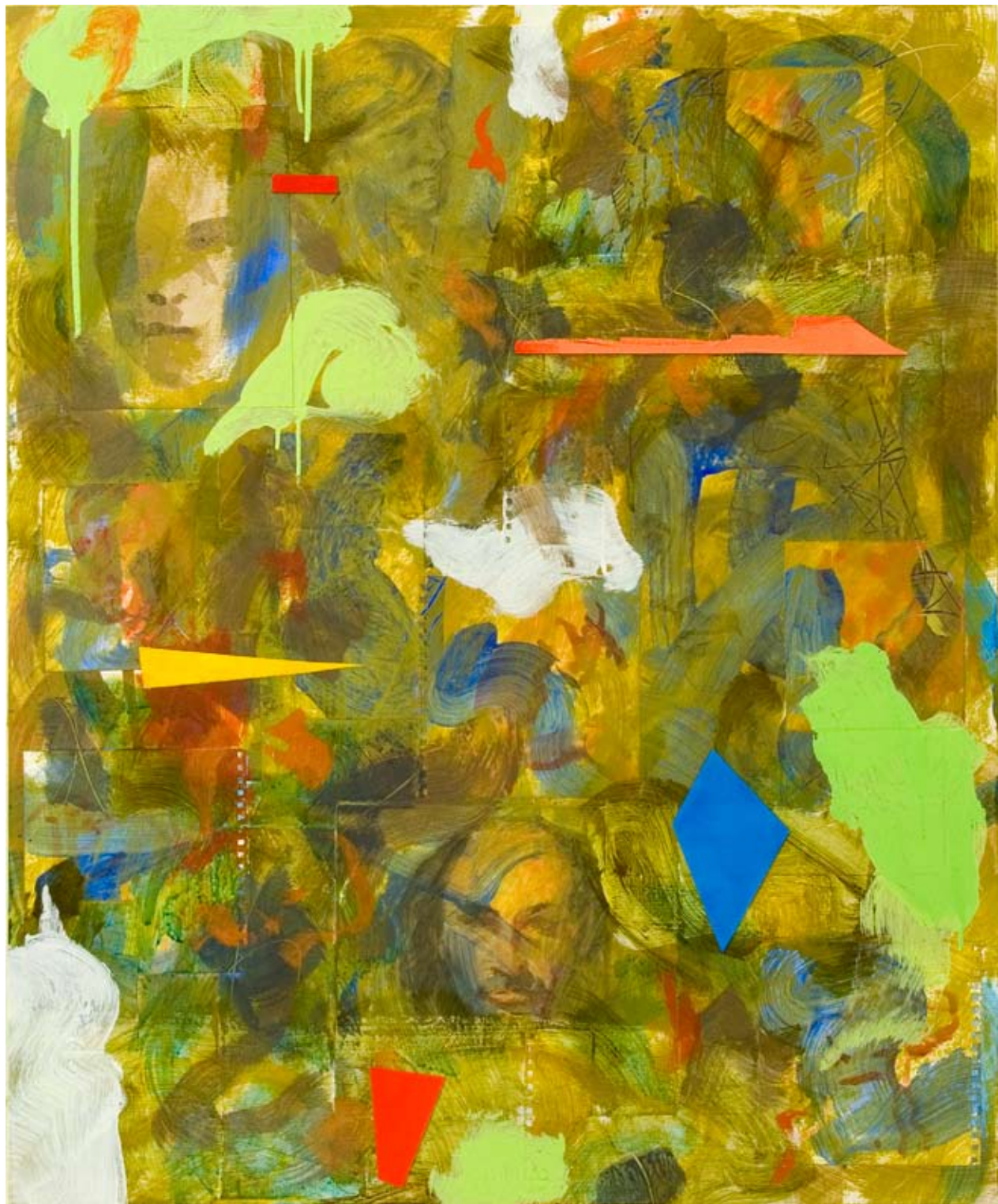
"Forest" , 2011 40" x 48.5" 101.6 x 123.2 cm charcoal, ink, water color, acrylic, wood, museum-board and paper on wood panel