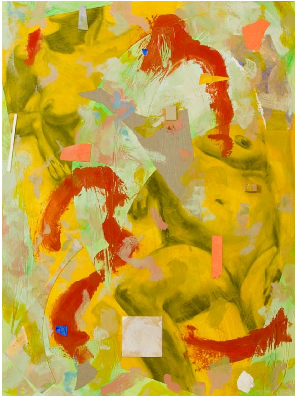
"Counter Intuitive" , 2011 48.5" x 36" 123.2 x 91.4 cm charcoal, graphite, acrylic, rice paper, wood museum-board and paper on wood panel