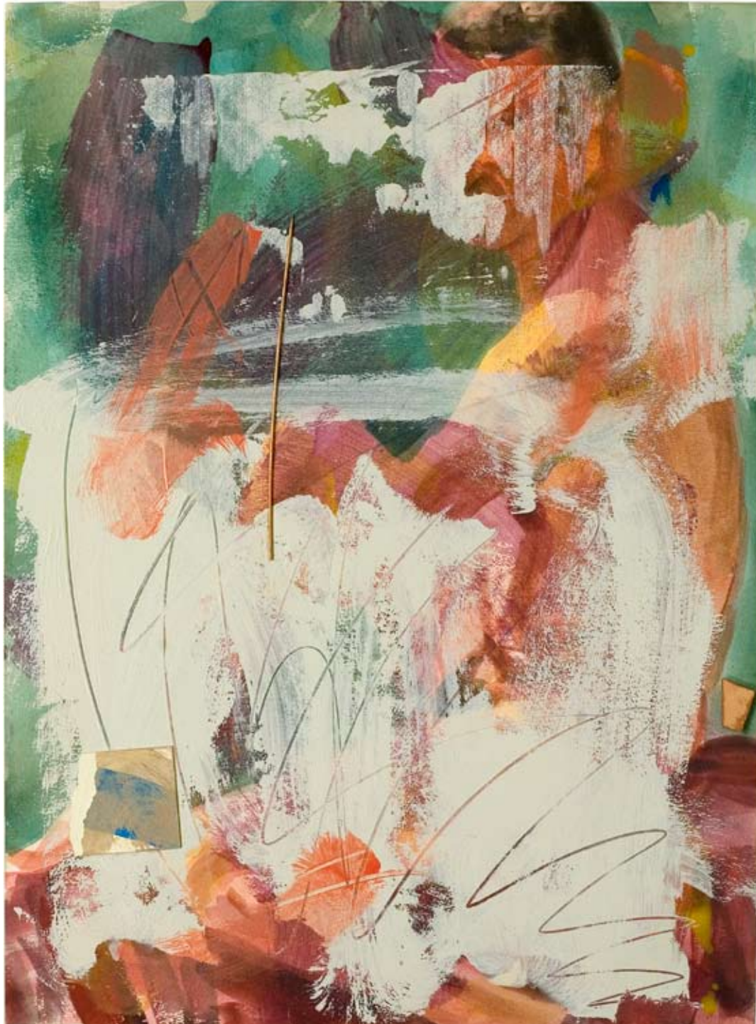
"Thespian" , 2010 30" x 22" 76.2 x 55.9 cm watercolor, acrylic, wood, museum-board and paper on wood panel