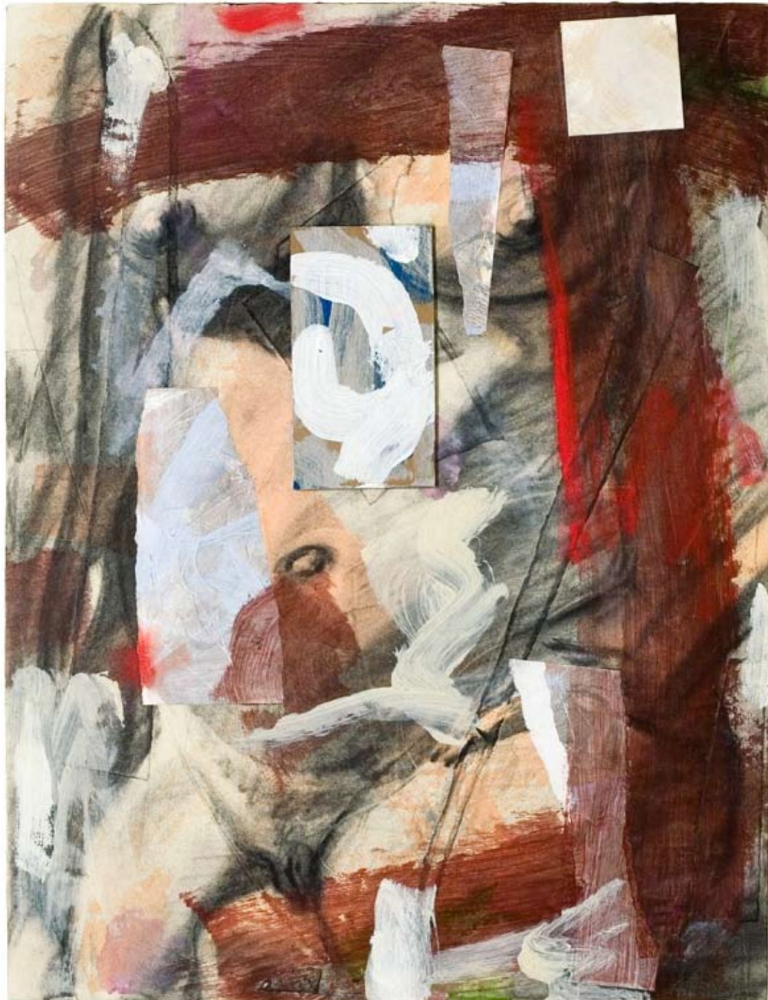
"Woman I", 2010 26" x 20" 66 x 50.8 cm charcoal, acrylic, museum-board and paper on wood panel