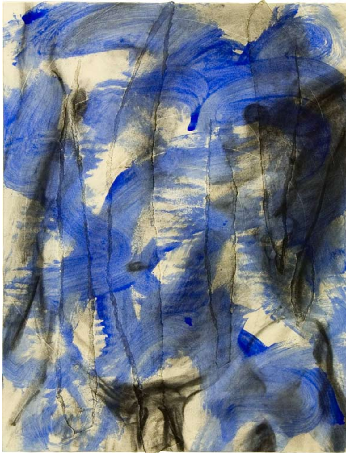
"Kind a Blue", 2011 26" X 20" 45.7 x 41.9 cm charcoal, acrylic, and paper on wood panel