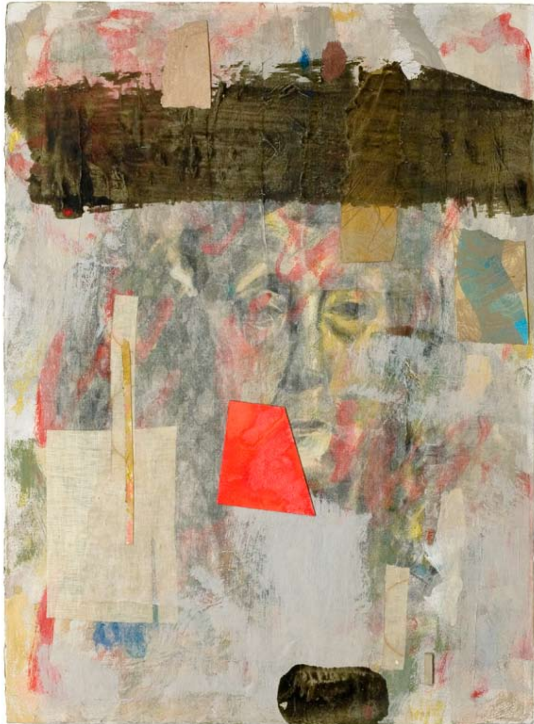
"Vigil", 2010 30" x 22" 76.2 x 55.9 cm charcoal, ink, acrylic, rice paper, museum-board, linen and paper on wood panel