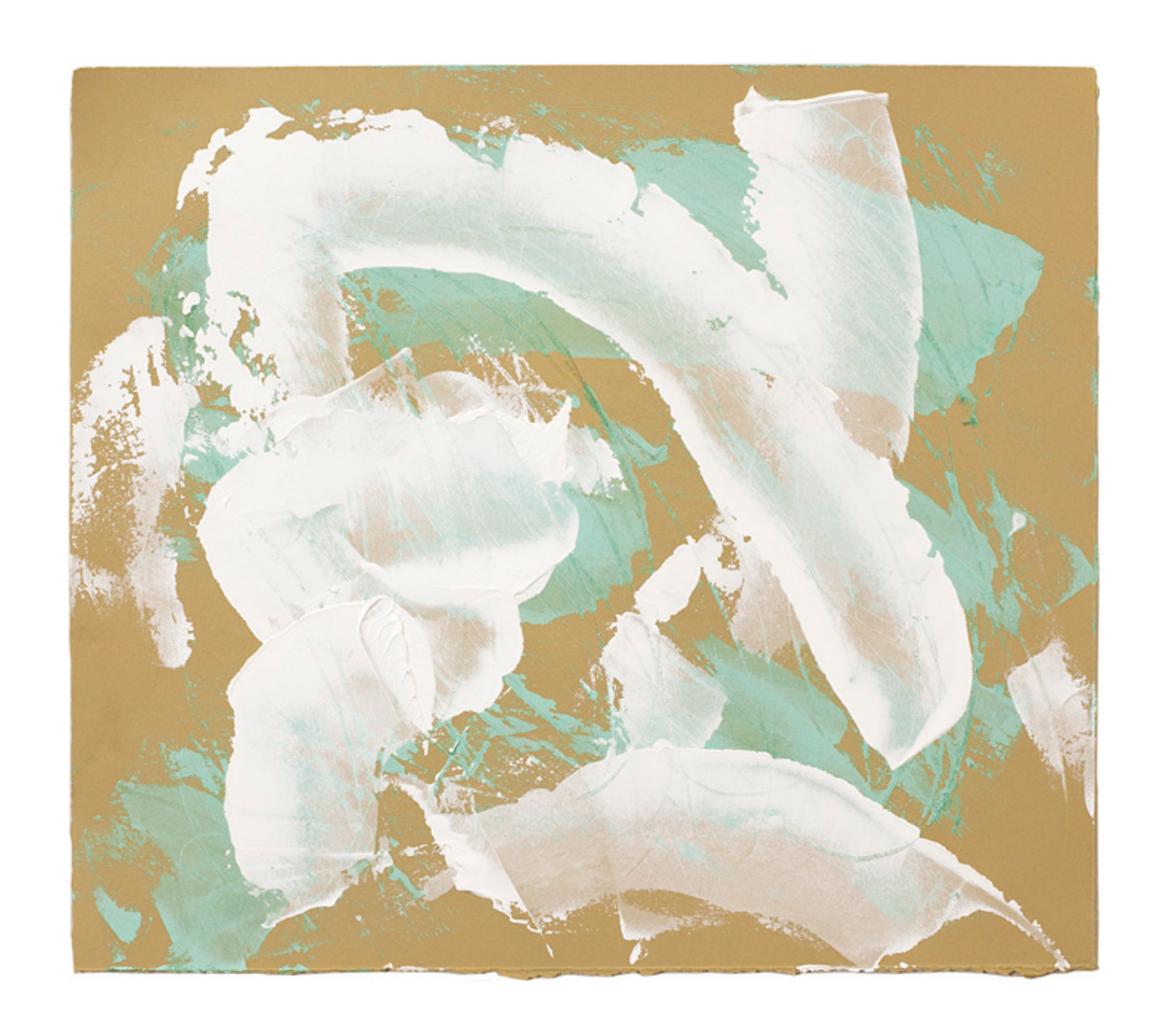
"lucky strike", 2015 13 x 14 in 33 x 36 cm acrylic and paper on wood panel