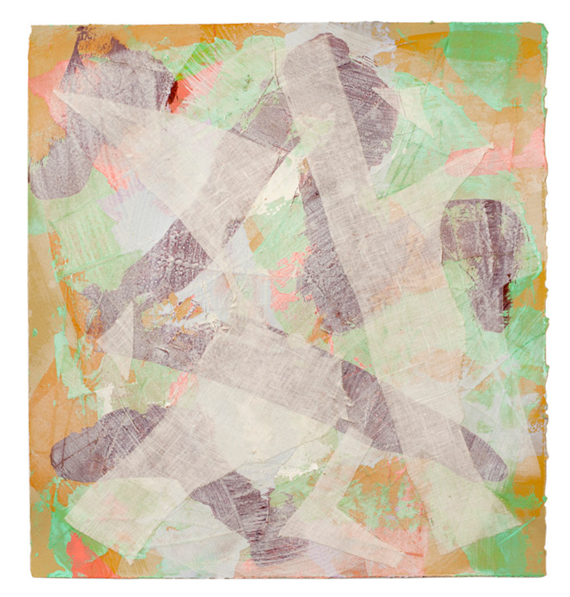
"veil", 2015 15 x 14 in 38 x 36x cm acrylic, linen and paper on wood panel