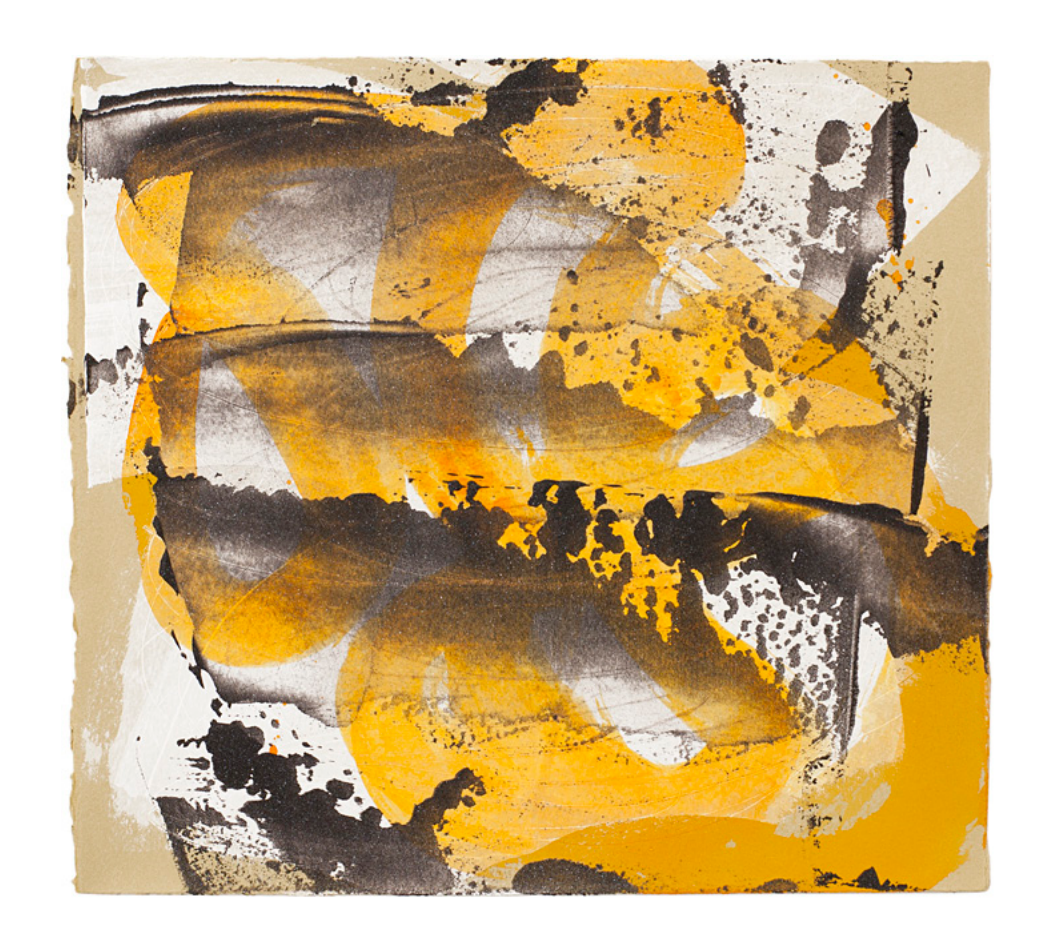
"riff", 2015 10 x 11 in 25 x 28 cm acrylic and paper on wood panel