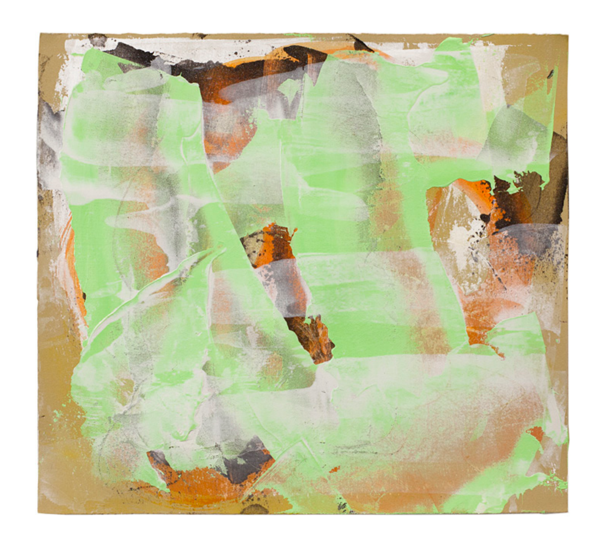
"melon", 2015 10 x 11 in 25 x 28 cm acrylic and paper on wood panel