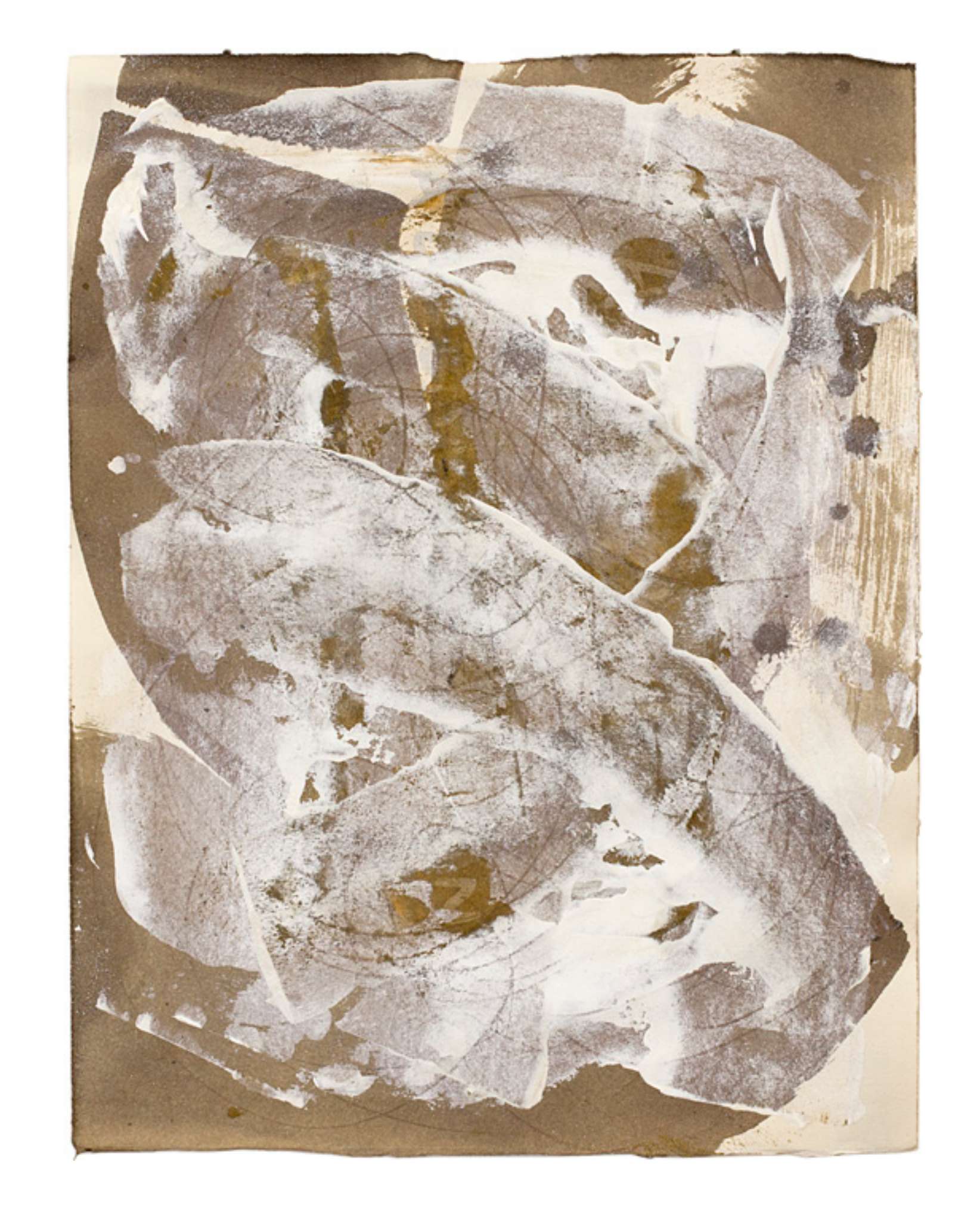
"wormhole", 2015 13 x 10 in 33 x 25 cm acrylic and paper on wood panel