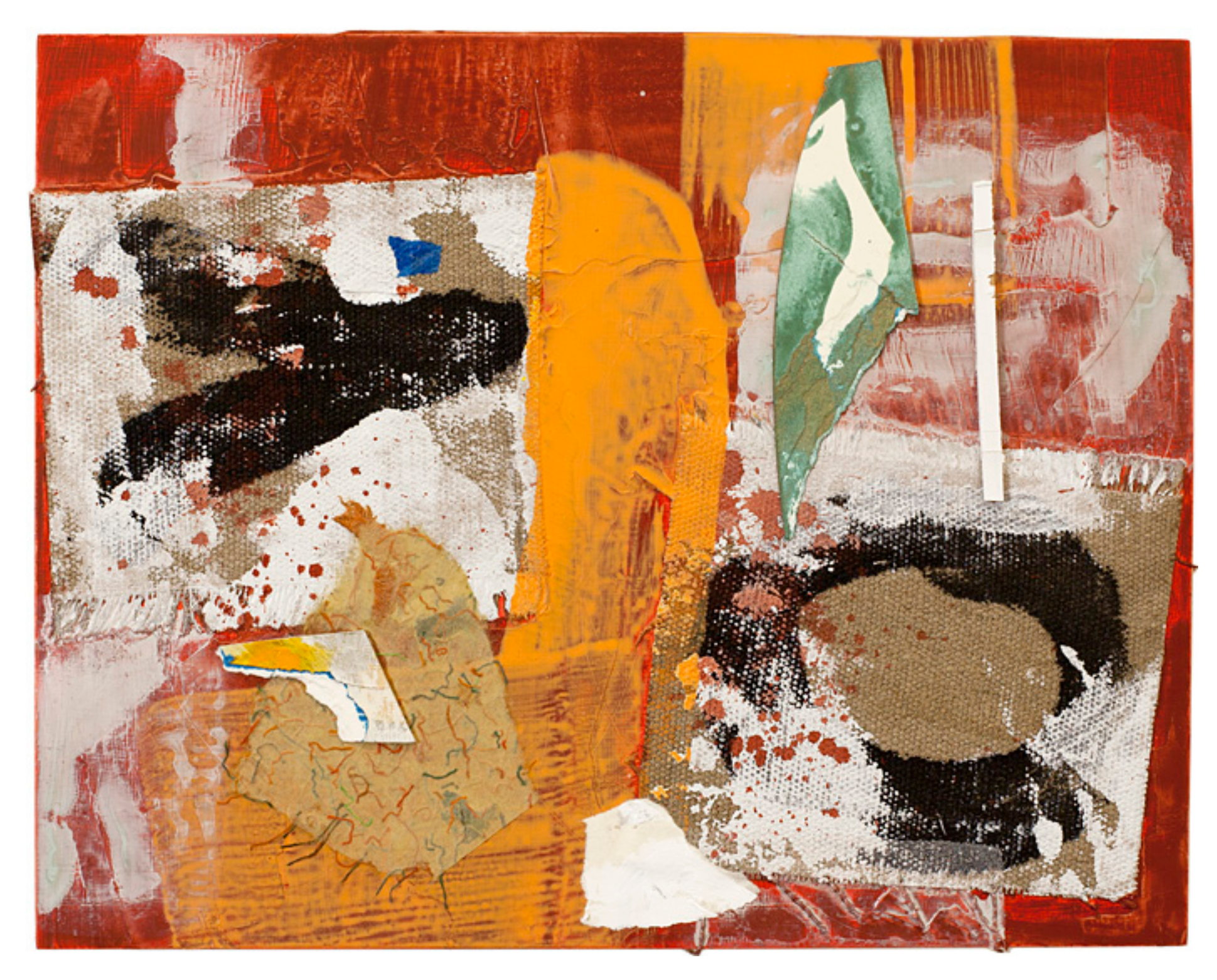
"love fest", 2015 11 x 14 in 28 x 35 cm acrylic, rice paper, museum-board, linen and paper on wood panel