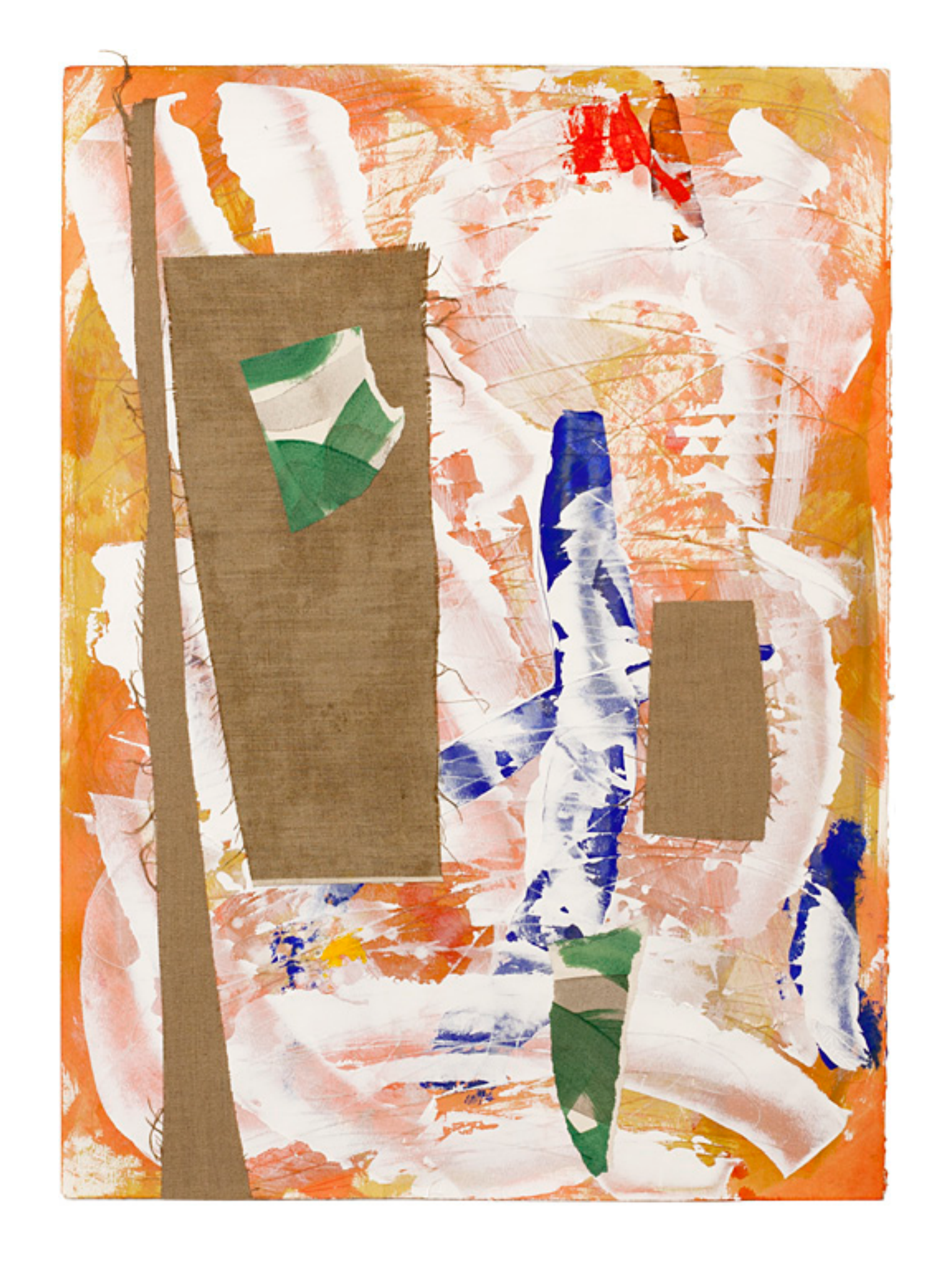
"long tall sally", 2015 30 x 22 in 76 x 56 cm acrylic, rice paper linen and paper on wood panel