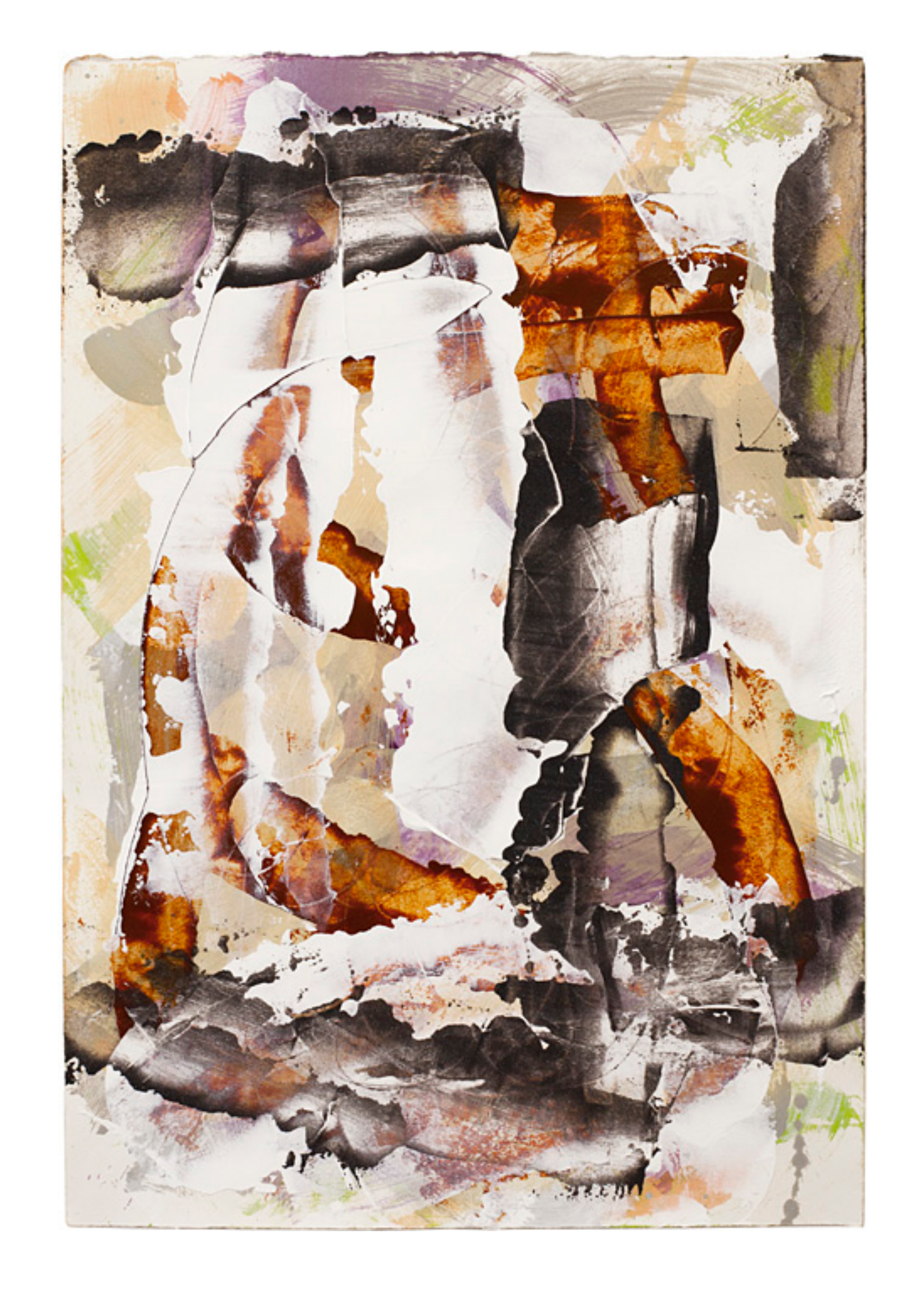
"tangle", 2015 22 x 15 in 56 x 38 cm acrylic and paper on wood panel