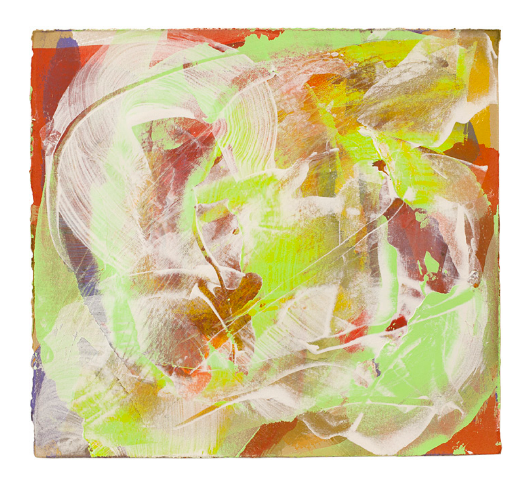
"wigged out", 2015 10 x 11 in 25 x 28 cm acrylic and paper on wood panel