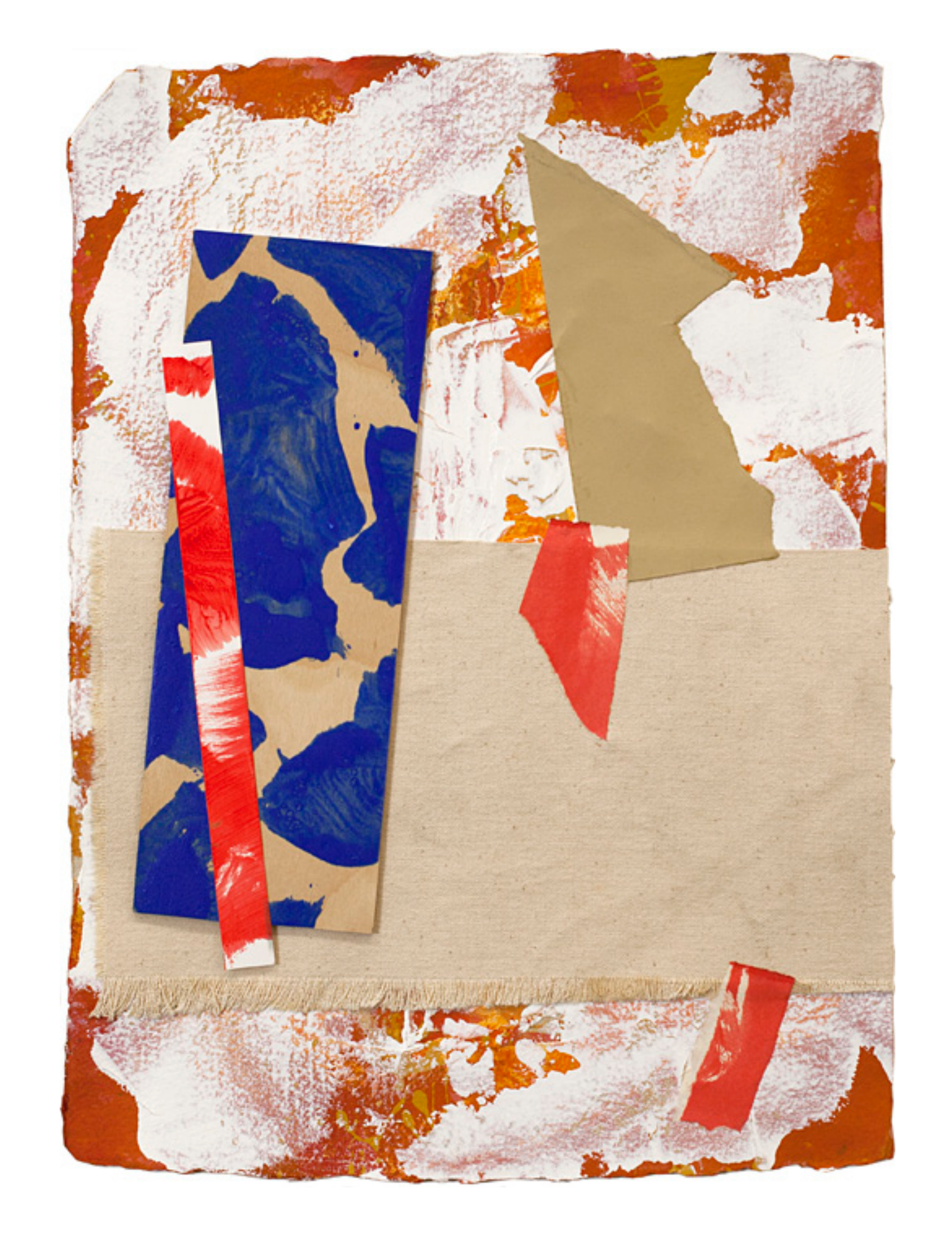
"no smoke and mirrors", 2015 20 x 14.5 in 50 x 37 cm acrylic, wood and paper on wood panel