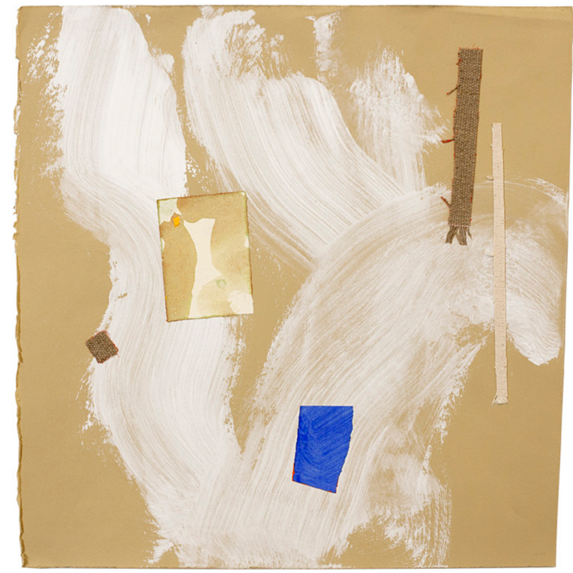
"lyrical passage", 2015 16 x 15.5 in 41 x 39 cm acrylic, canvas, linen and paper on wood panel