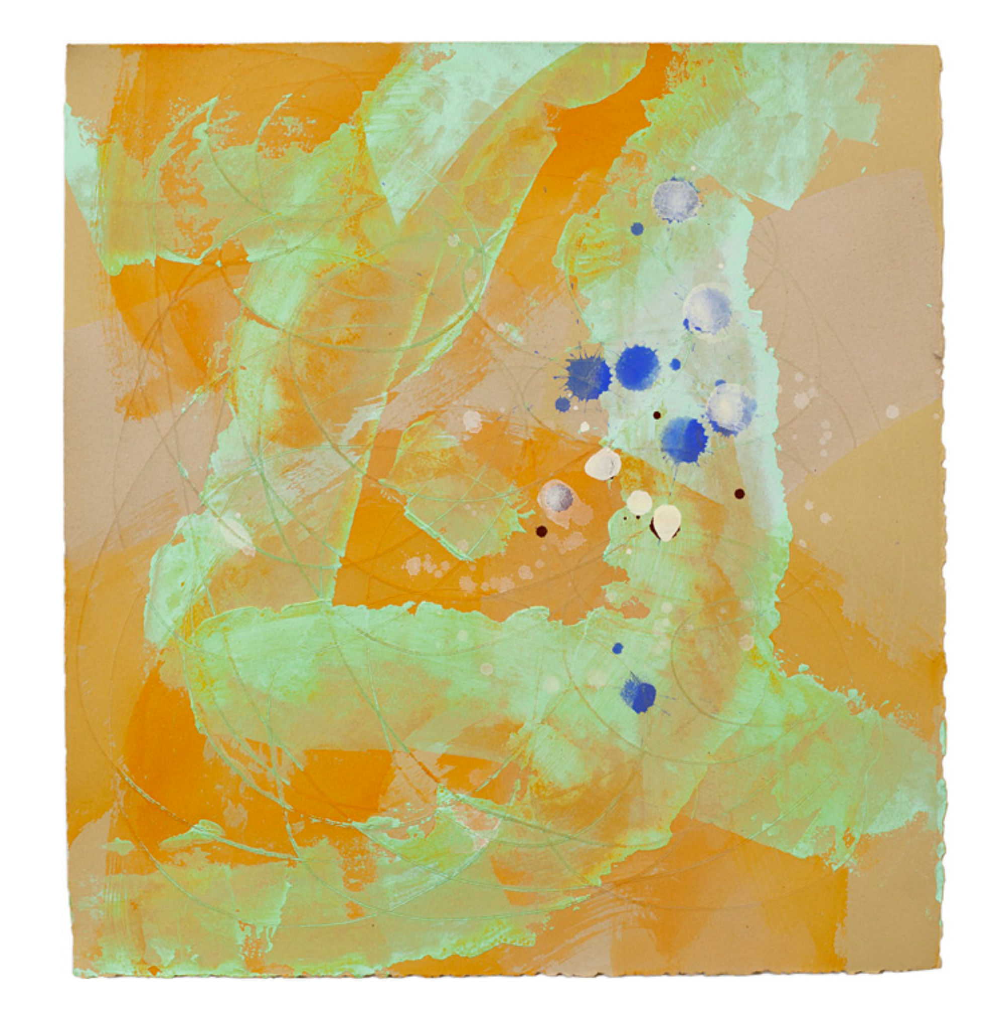
"nucleotide", 2015 15 x 14 in 38 x 36 cm acrylic and paper on wood panel