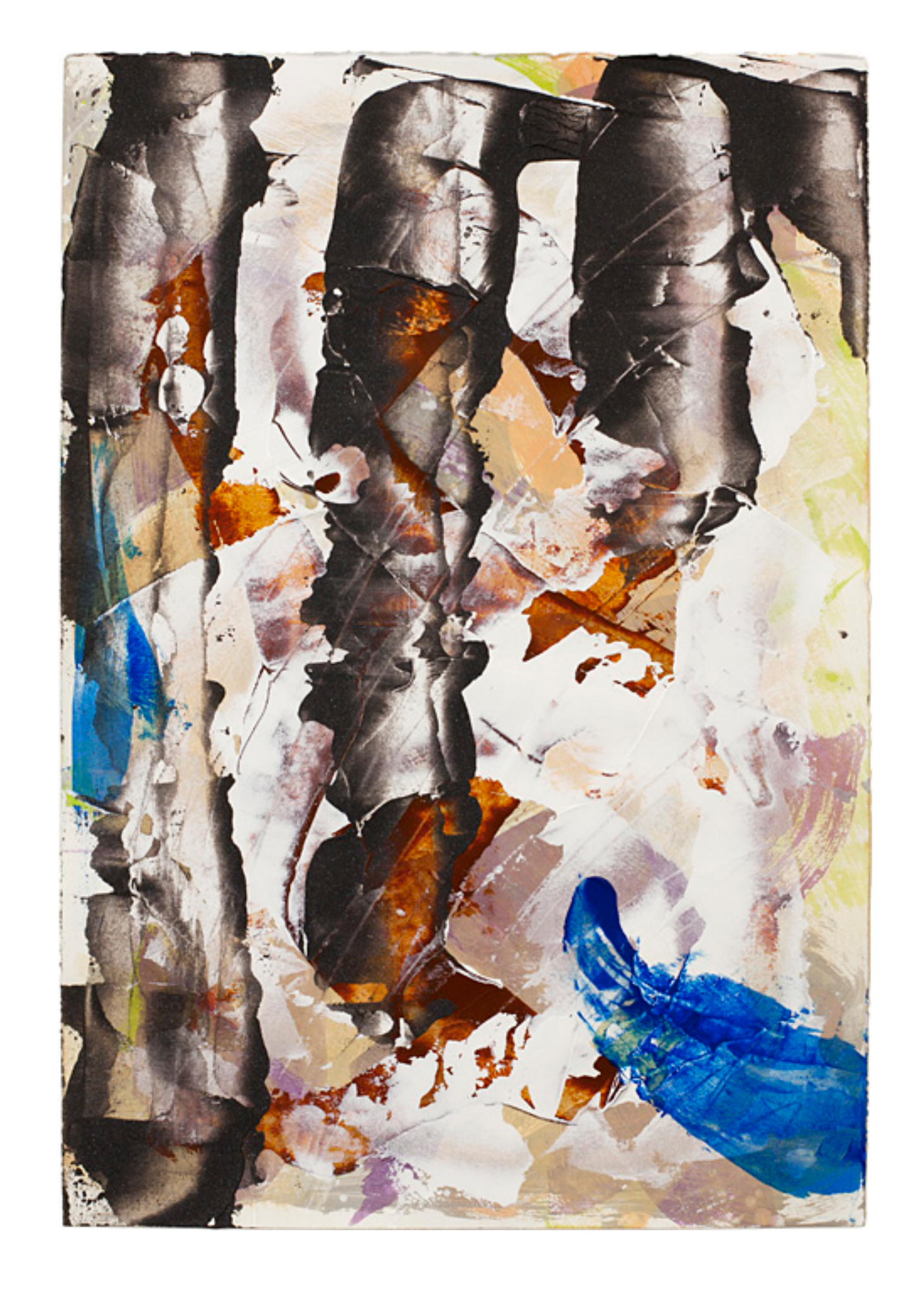
"progression", 2015 22 x 15 in 56 x 38 cm acrylic and paper on wood panel