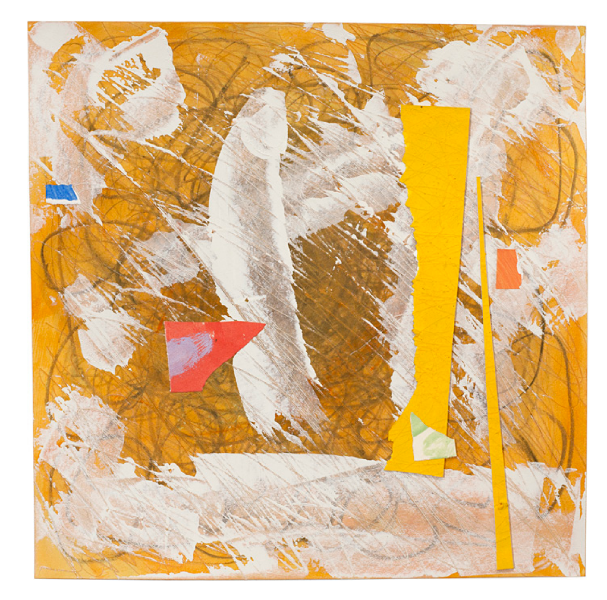
"solar", 2015 16 x 16 in 41 x 41 cm acrylic, graphite, museum-board and paper on wood panel