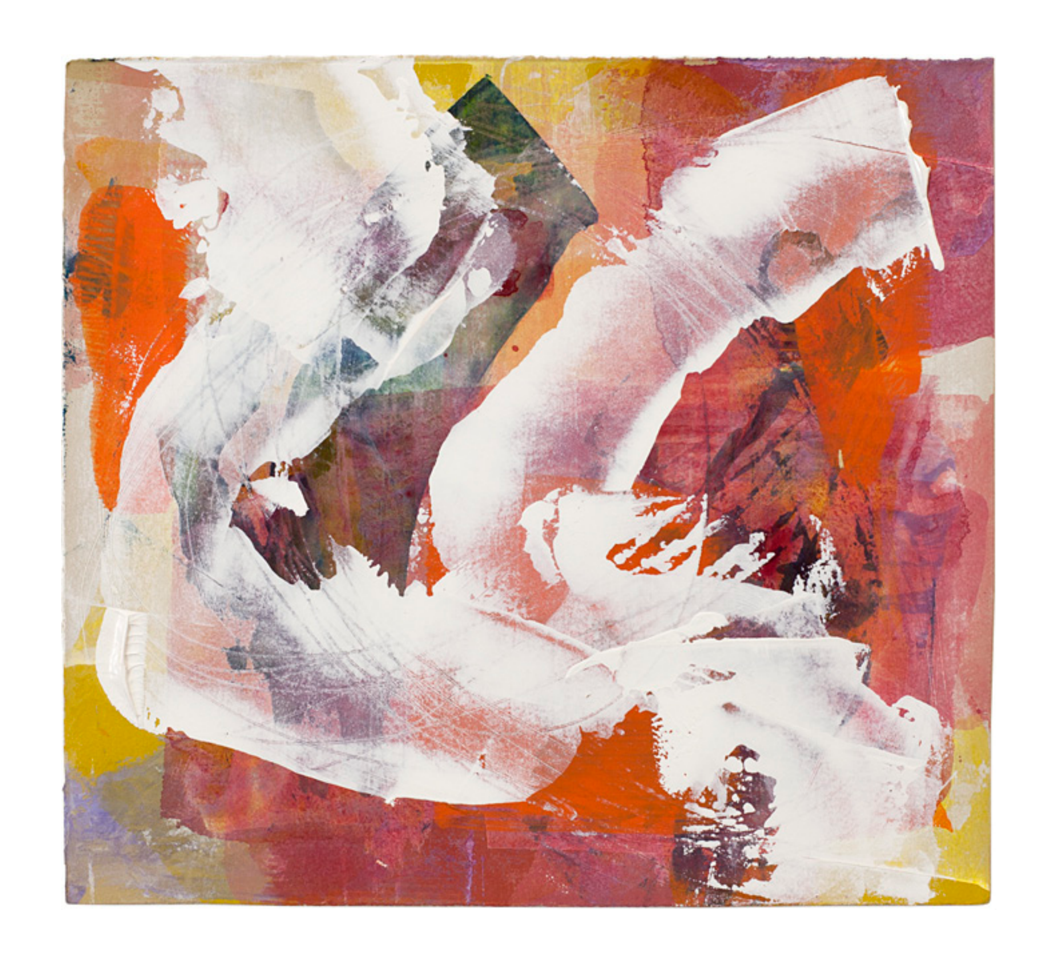
"somersault", 2015 10 x 11 in 25 x 28 cm acrylic and paper on wood panel