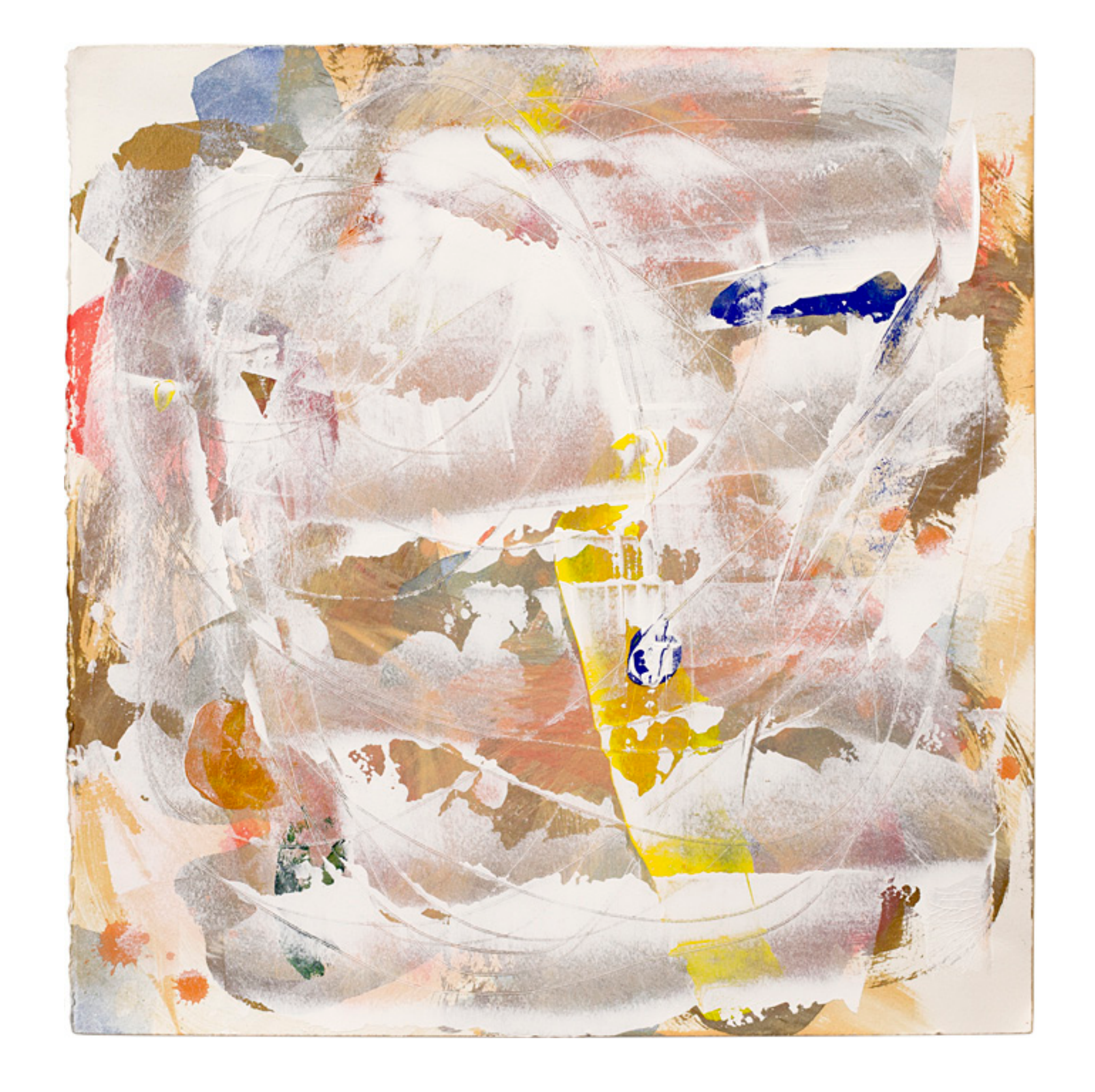
"blizzard", 2015 15 x 15 in 38 x 38 cm acrylic and paper on wood panel