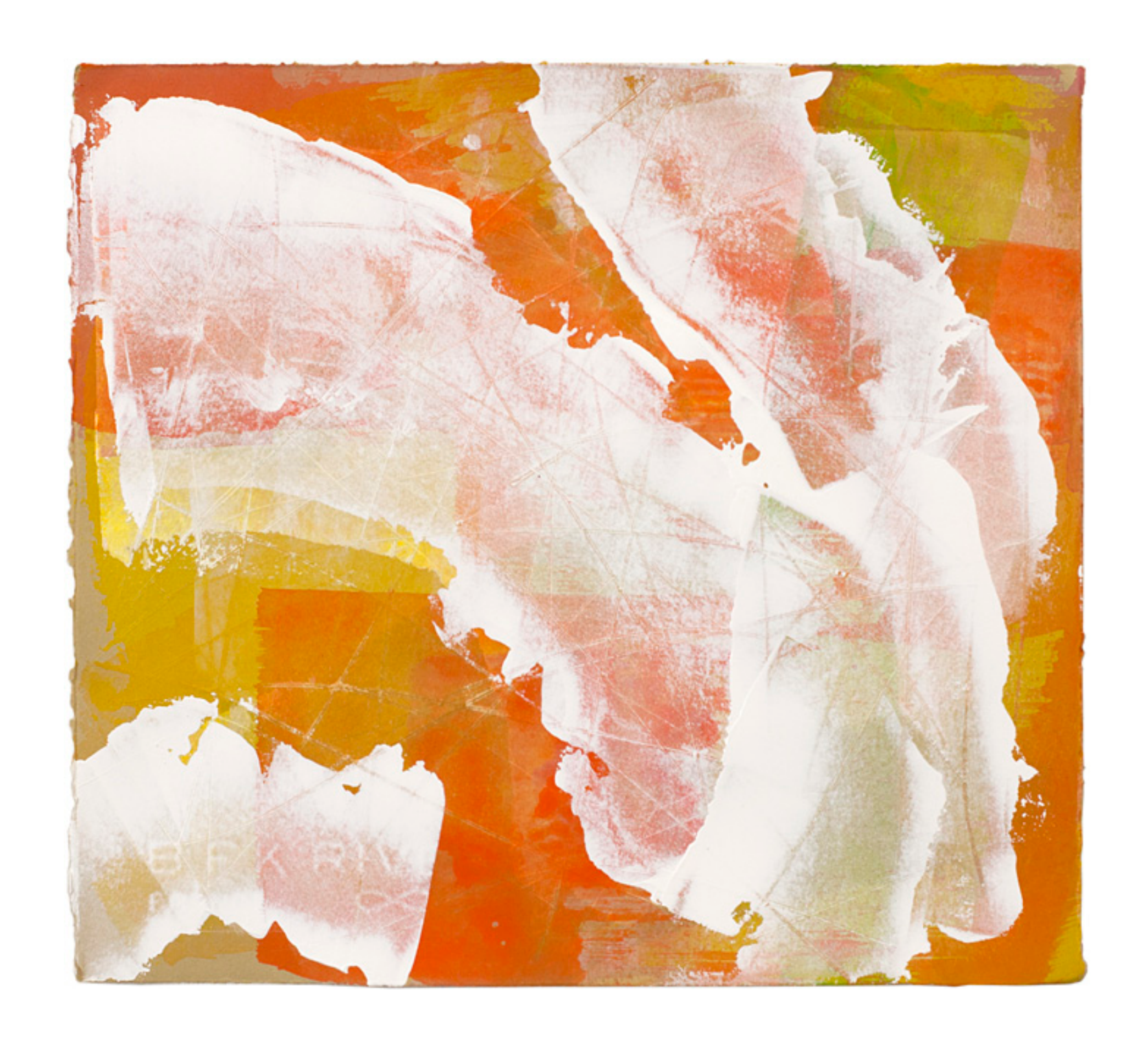
"arc", 2015 10 x 11 in 25 x 28 cm acrylic and paper on wood panel