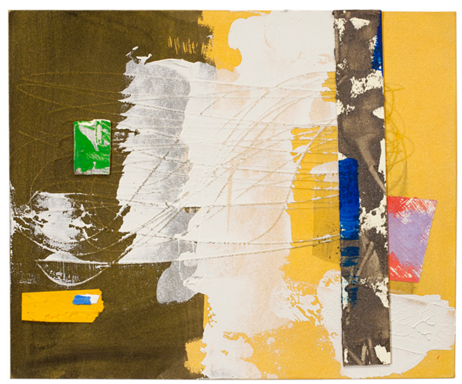
"backyard", 2015 9 x 11 in 23 x 28 cm acrylic, museum-board and paper on wood panel