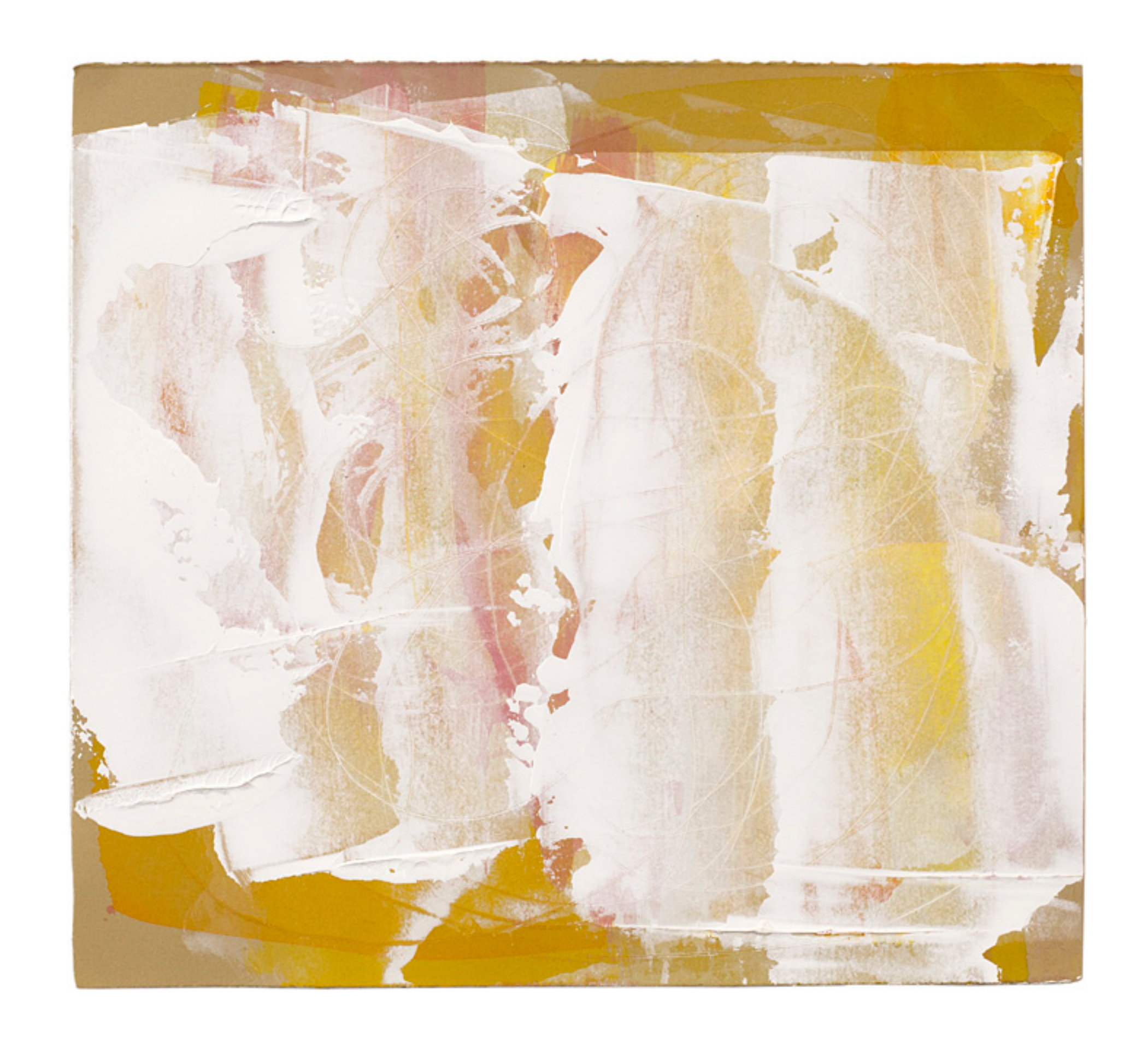
"sonet", 2015 10 x 11 in 25 x 28 cm acrylic and paper on wood panel