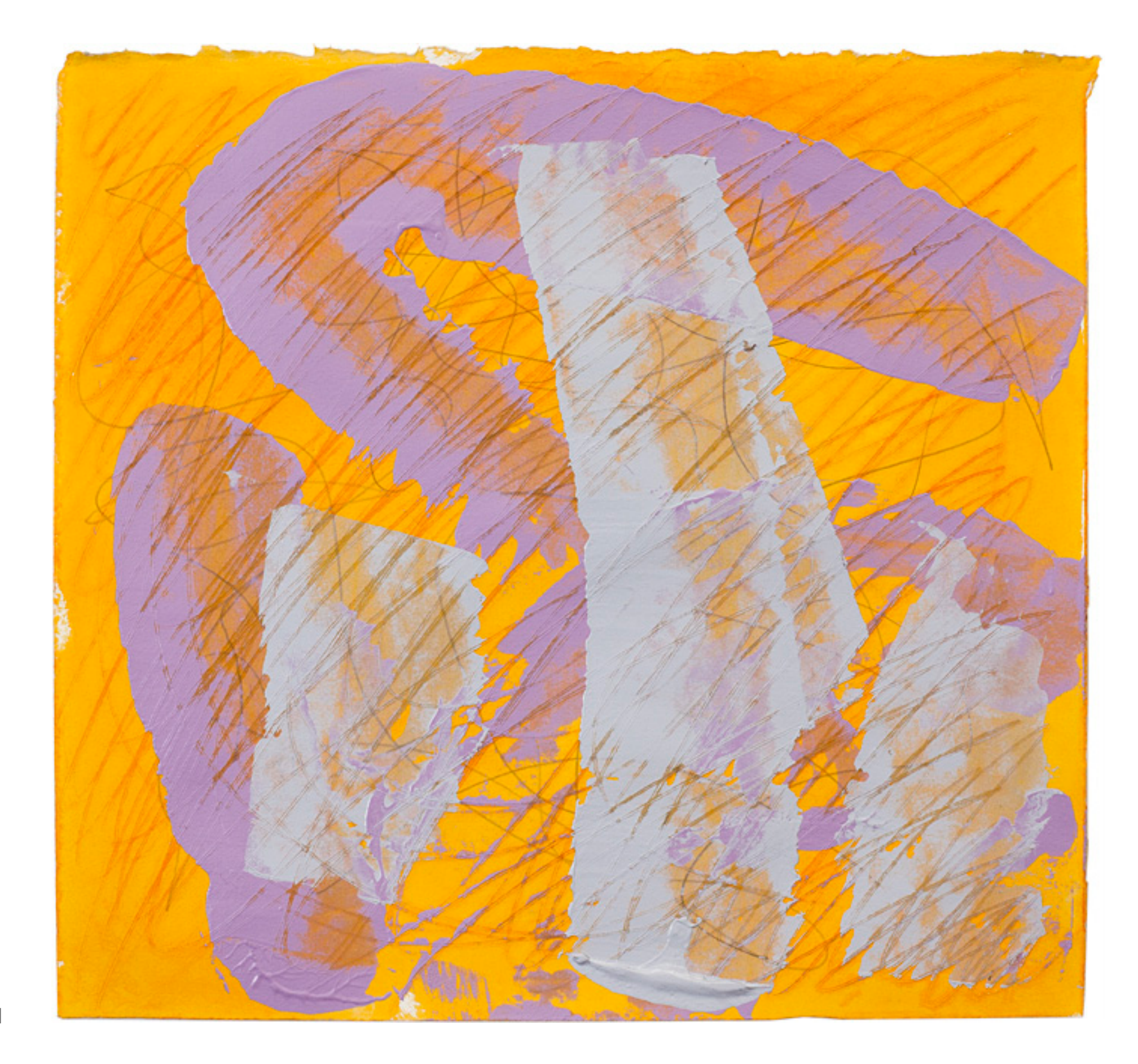
"sonic", 2015 14 x 15 in 36 x 38 cm acrylic, graphite and paper on wood panel