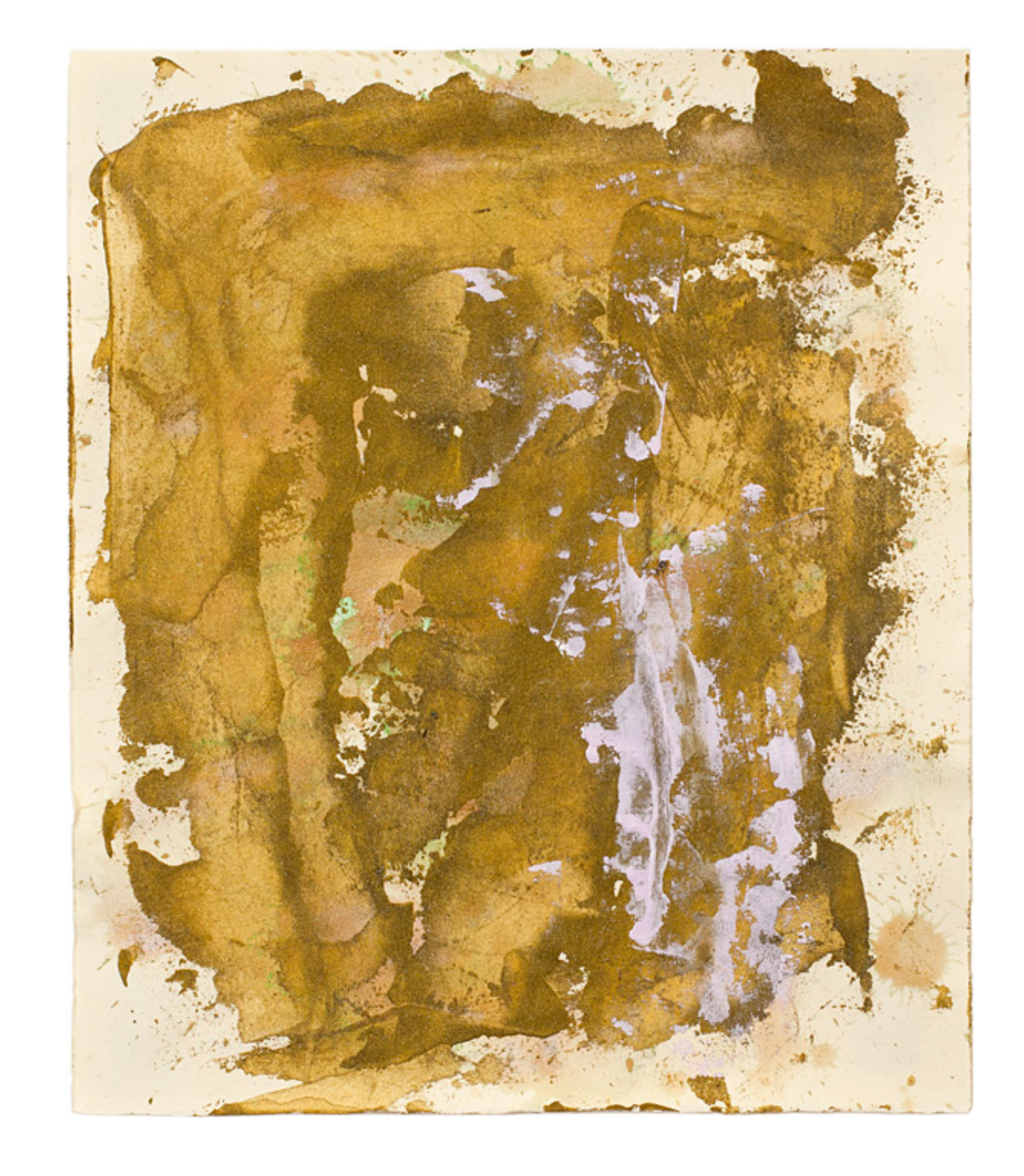
"celestial", 2015 12 x 10 in 30 x 25 cm acrylic and paper on wood panel