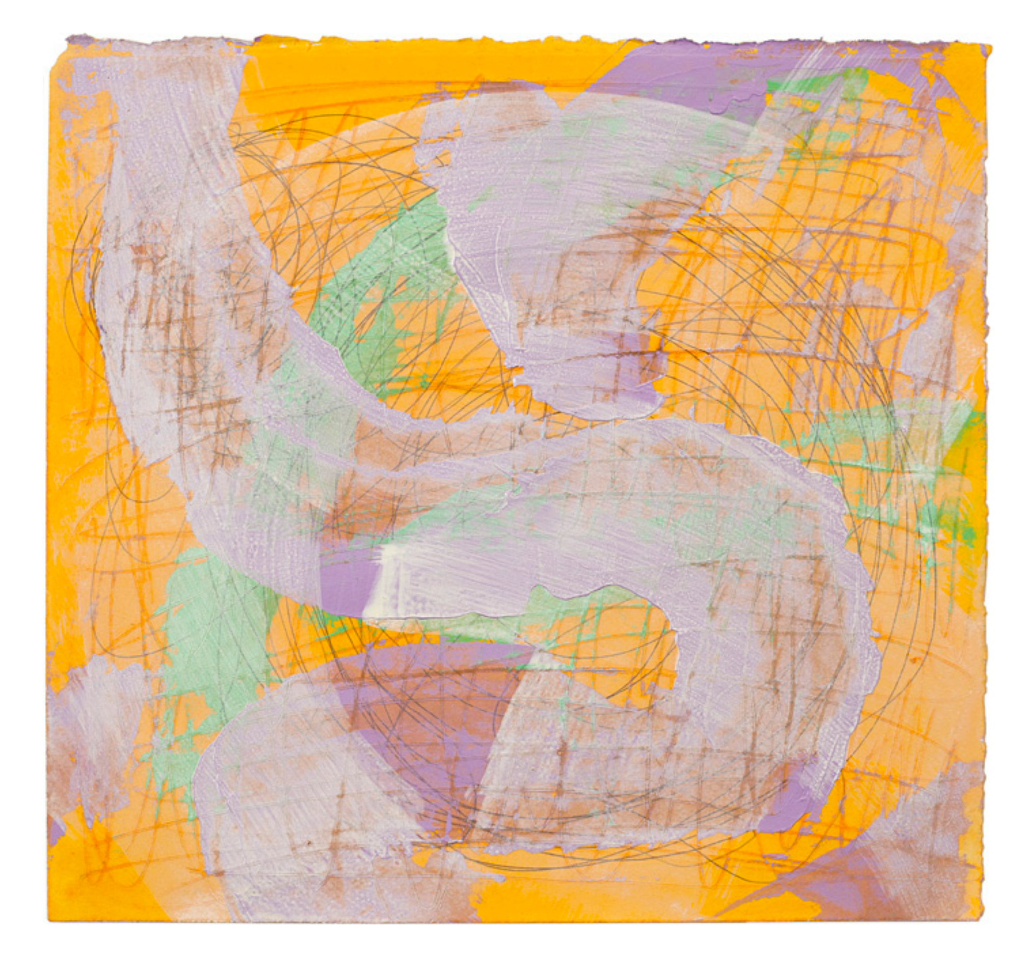
"dervish", 2015 14 x 15 in 36 x 38 cm acrylic, graphite and paper on wood panel