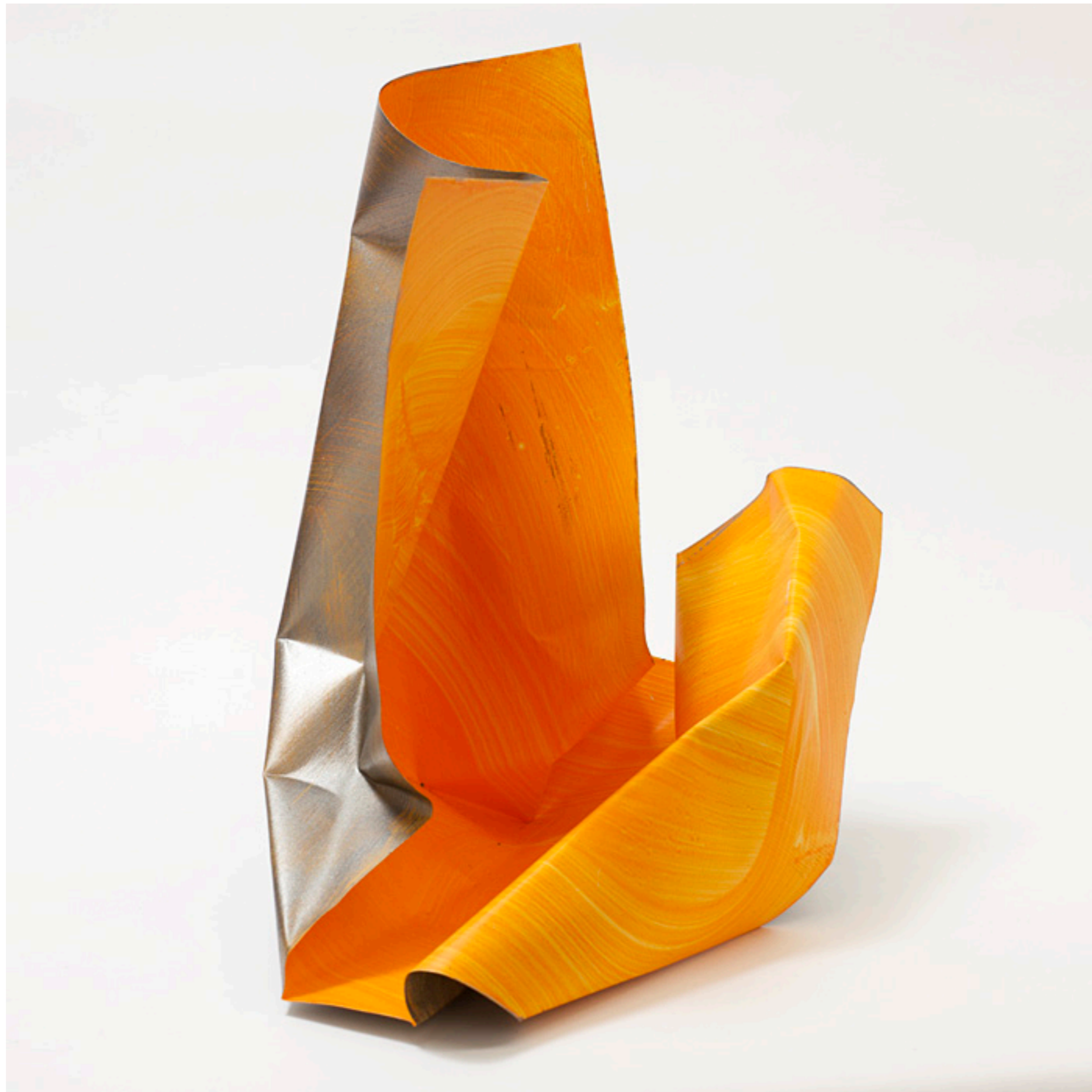
"fleur argent", 2015 15.5 x 16 x 12 in 39.5 x 40.5 x 30.5 cm acrylic & alkaloid paint on aluminum