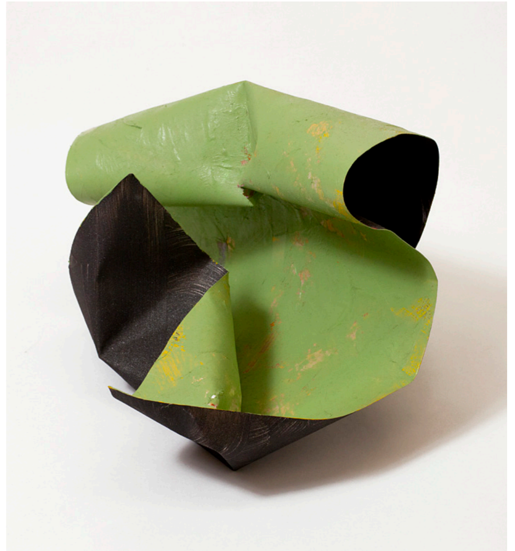
"swan", 2013 14 x 7 x 9 in 35.5 x 17.7 x 22.8 cm acrylic and paper on aluminum