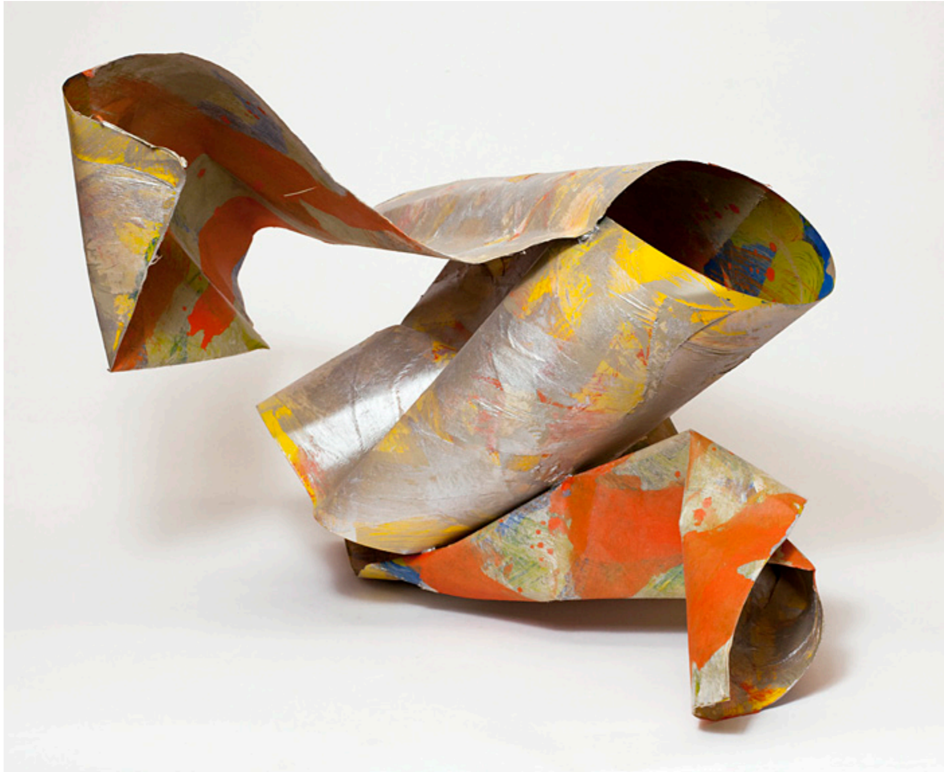
"ossieu", 2014 27 x 24 x 22 in 68.5 x 60.9 x 55.8 cm acrylic, canvas, rice paper and paper on aluminum