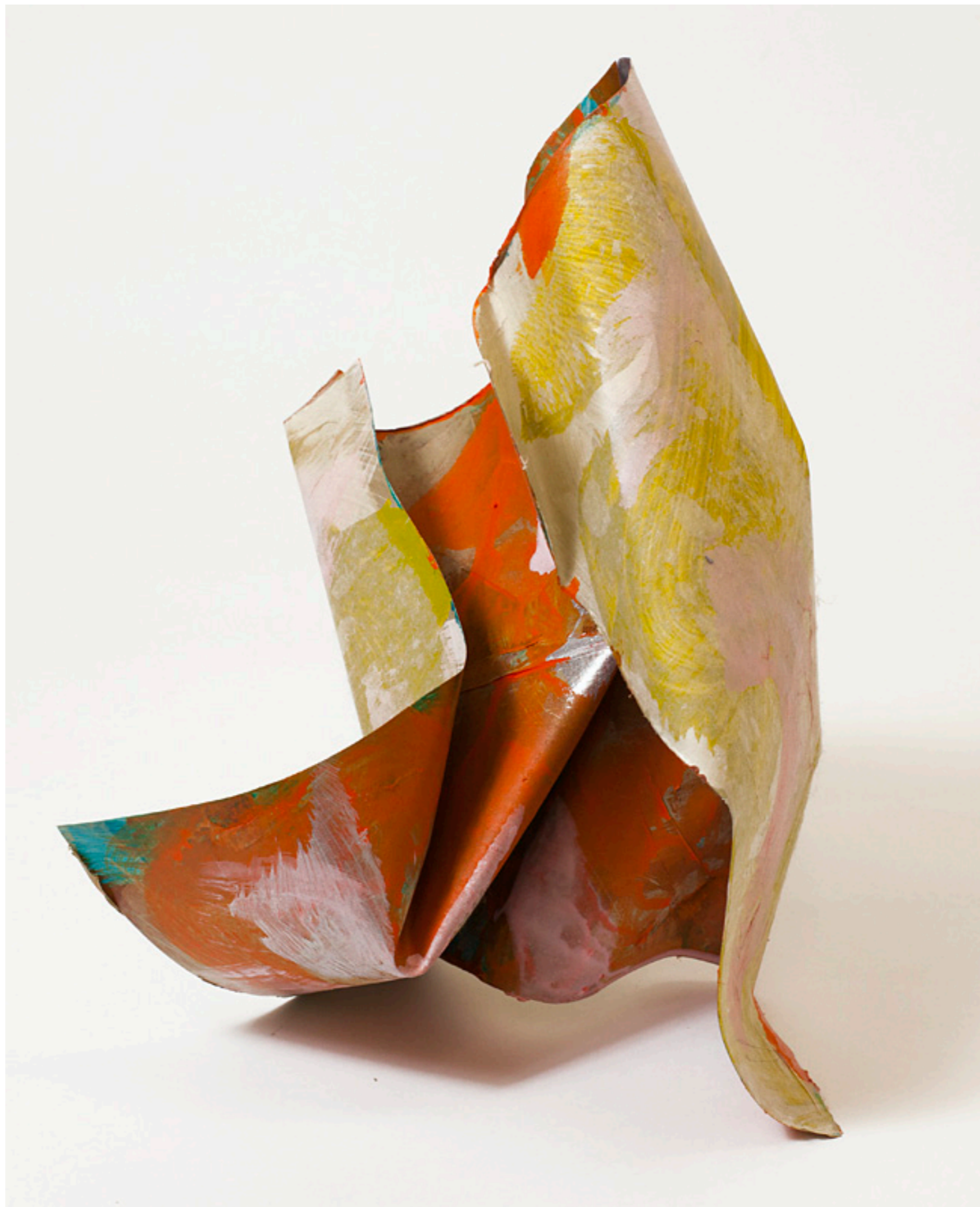
"canard", 2013 12 x 13.5 x 10 in 30.4 x 34.2 x 25.4 cm acrylic and rice paper on aluminum