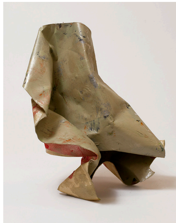
"petite oiseau", 2013 11.5 x 13.5 x 9 in 29.2 x 34.2 x 22.8 cm acrylic, paper, canvas and rice paper on aluminum