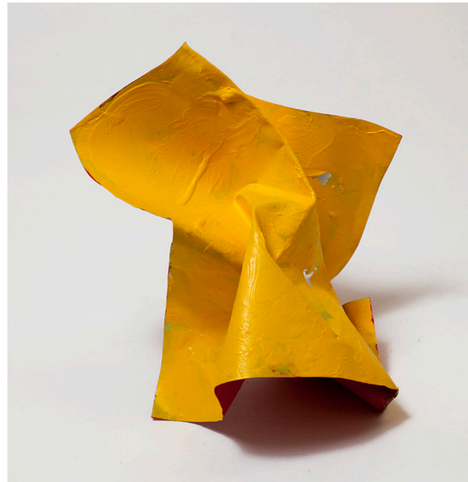
"canary", 2013 8 x 9 x 8 in 20.3 x 22.8 x 20.3 cm acrylic on aluminum