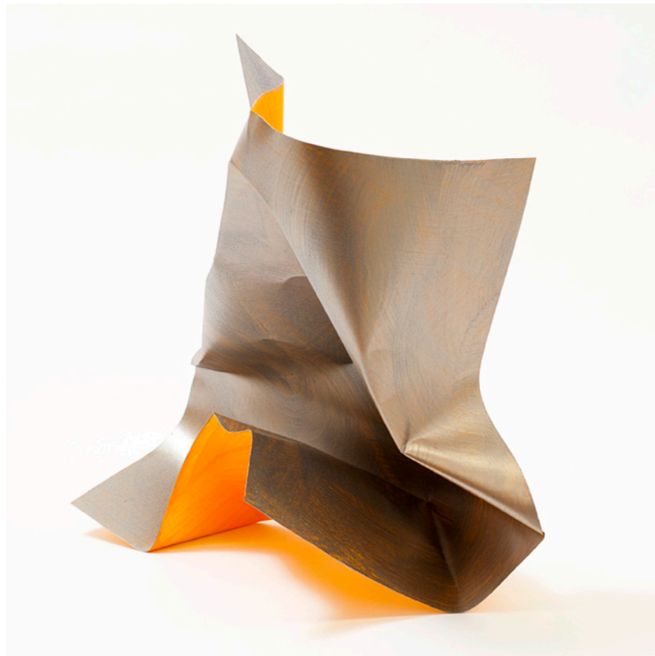
"fiore argento", 2015 15 x 14.5 x 8 in 38 x 37 x 20.5 cm acrylic & alkaloid paint on aluminum