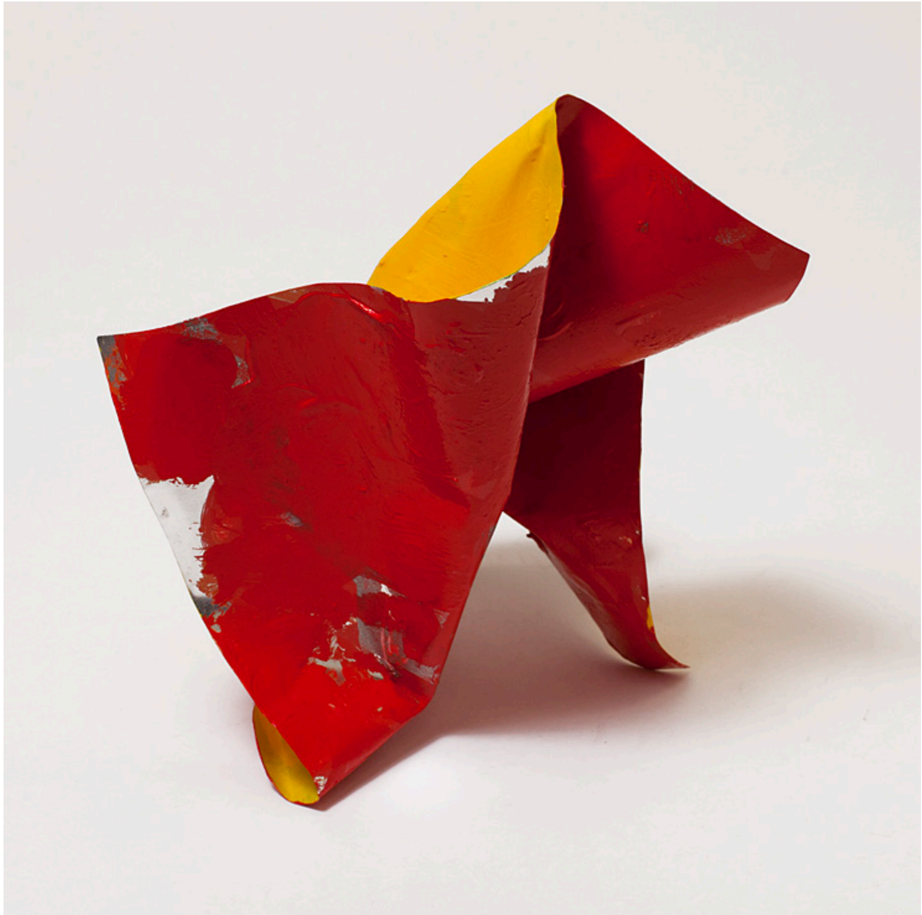
"canary", 2013 8 x 9 x 8 in 20.3 x 22.8 x 20.3 cm acrylic on aluminum