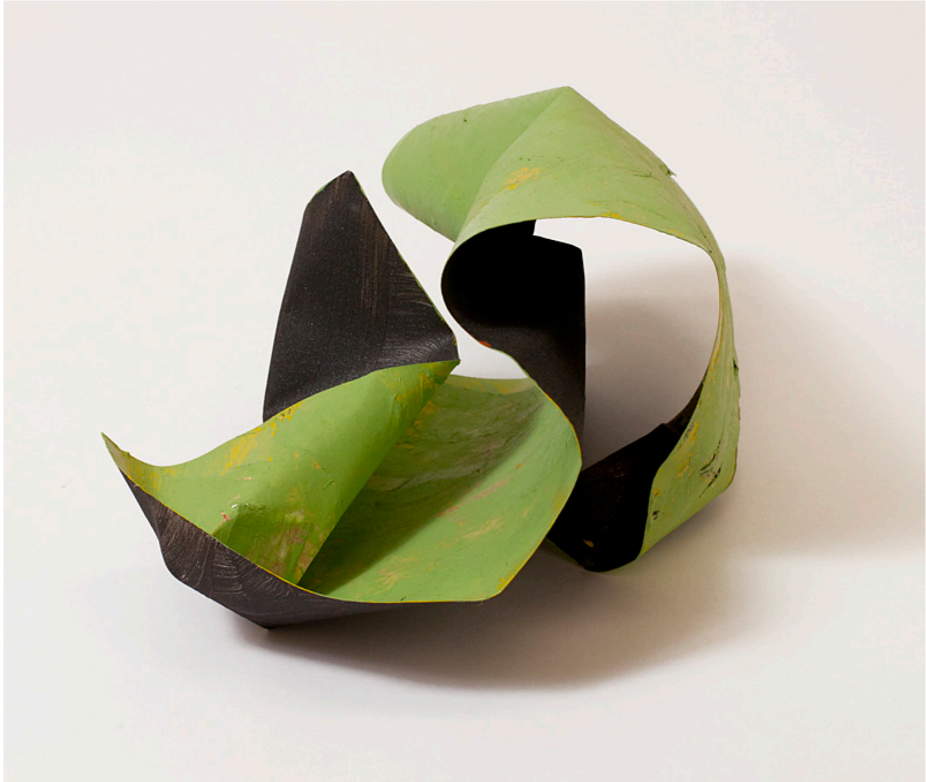
"swan", 2013 14 x 7 x 9 in 35.5 x 17.7 x 22.8 cm acrylic and paper on aluminum