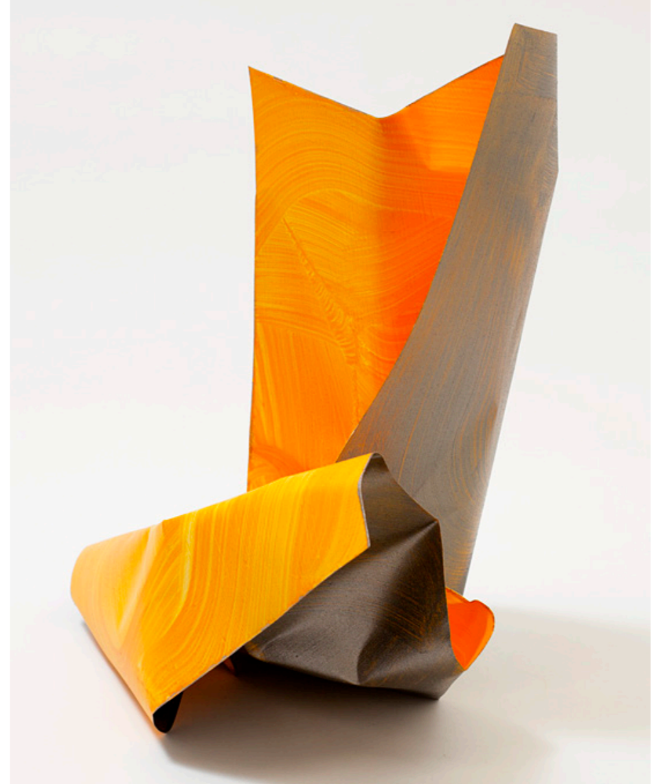
"fleur argent", 2015 15.5 x 16 x 12 in 39.5 x 40.5 x 30.5 cm acrylic & alkaloid paint on aluminum