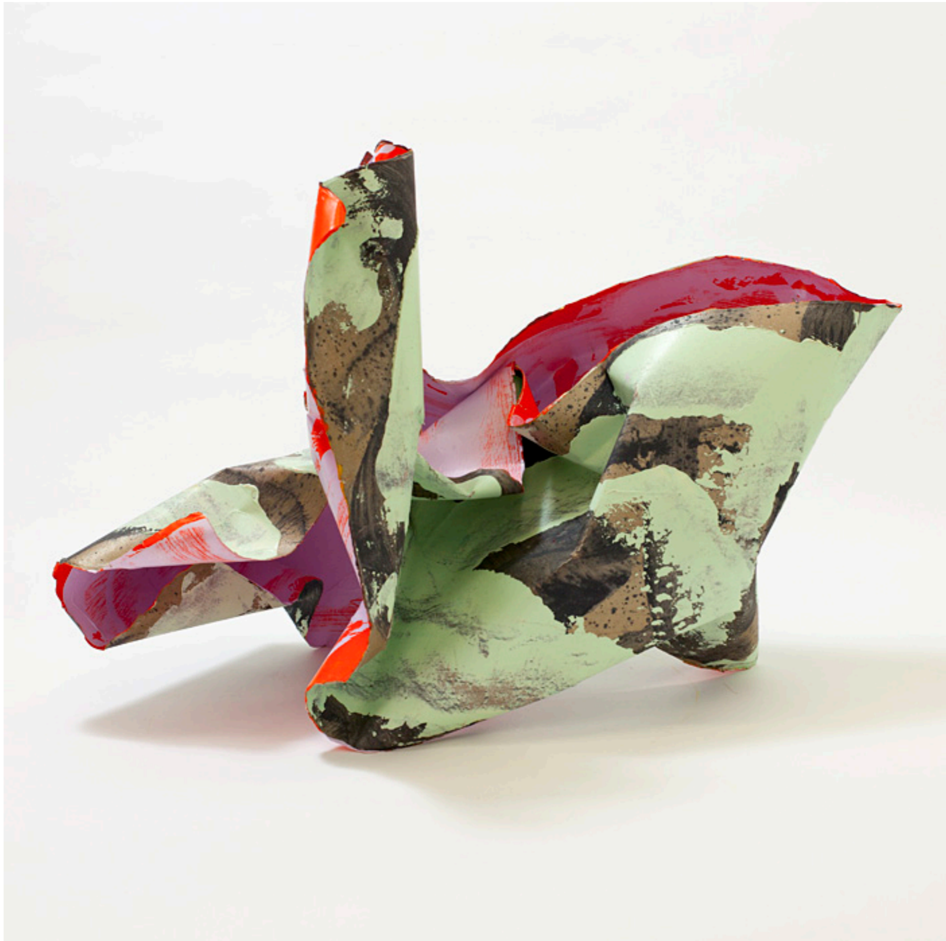
"meteor", 2015 18 x 27 x 14.5 in 45.5 x 68.5 x 37 cm acrylic and paper on aluminum