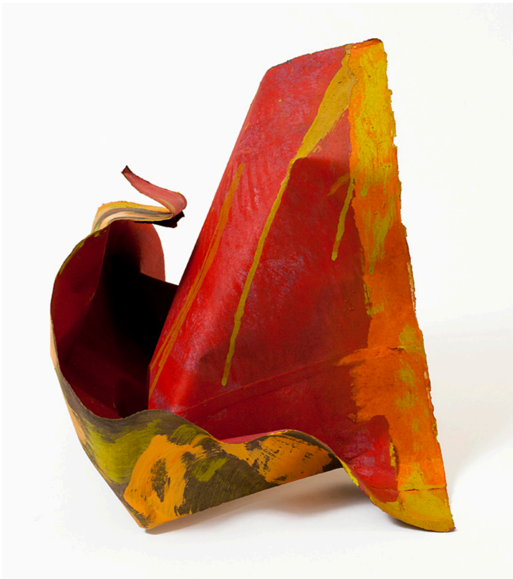
"canaria", 2013 17 x 12 x 14.5 in 43.1 x 30.4 x 36.8 cm acrylic and paper on aluminum