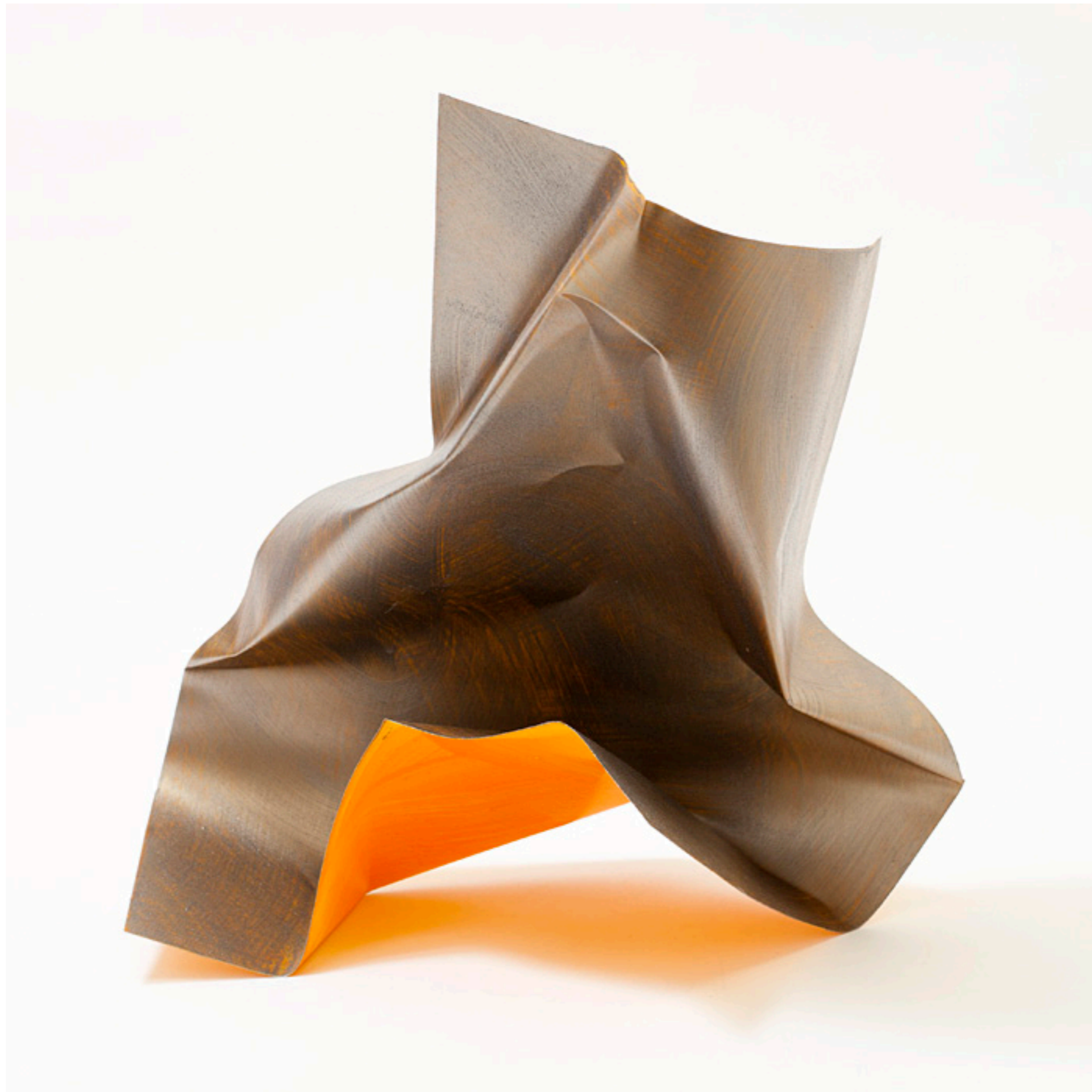
"fiore argento", 2015 15 x 14.5 x 8 in 38 x 37 x 20.5 cm acrylic & alkaloid paint on aluminum