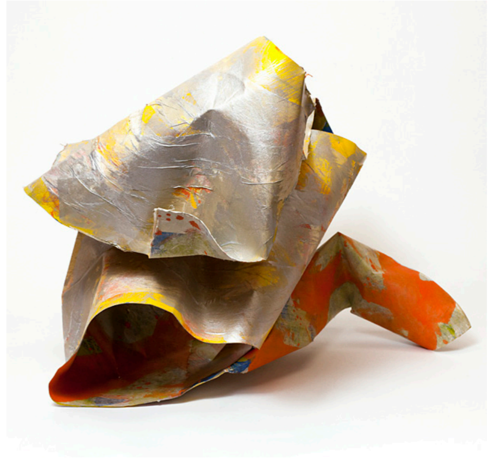
"ossieu", 2014 27 x 24 x 22 in 68.5 x 60.9 x 55.8 cm acrylic, canvas, rice paper and paper on aluminum