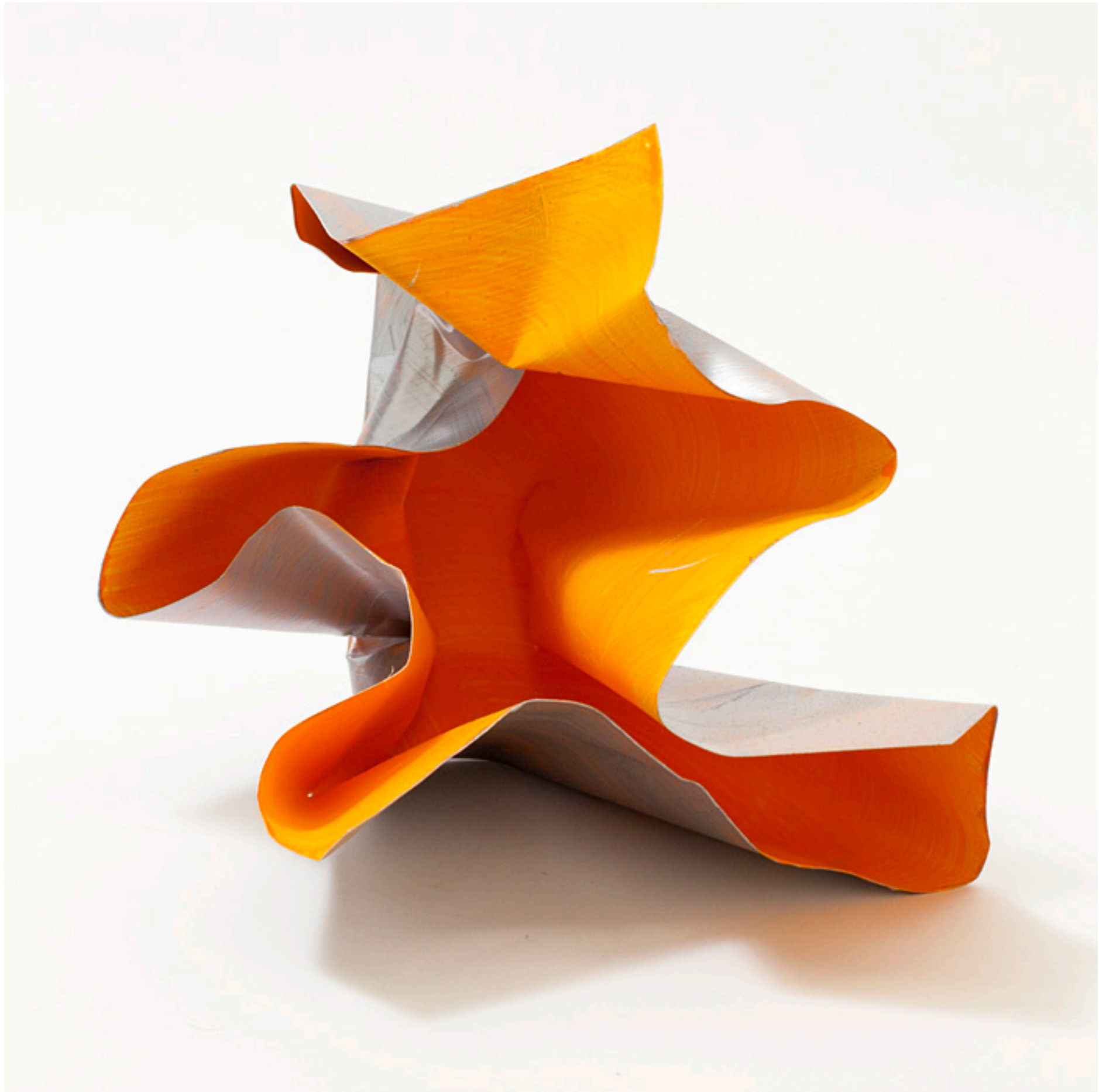
"silver bud", 2015 8 x 10.5 x 9 in 20.5 x 26 x 23 cm acrylic & alkaloid paint on aluminum