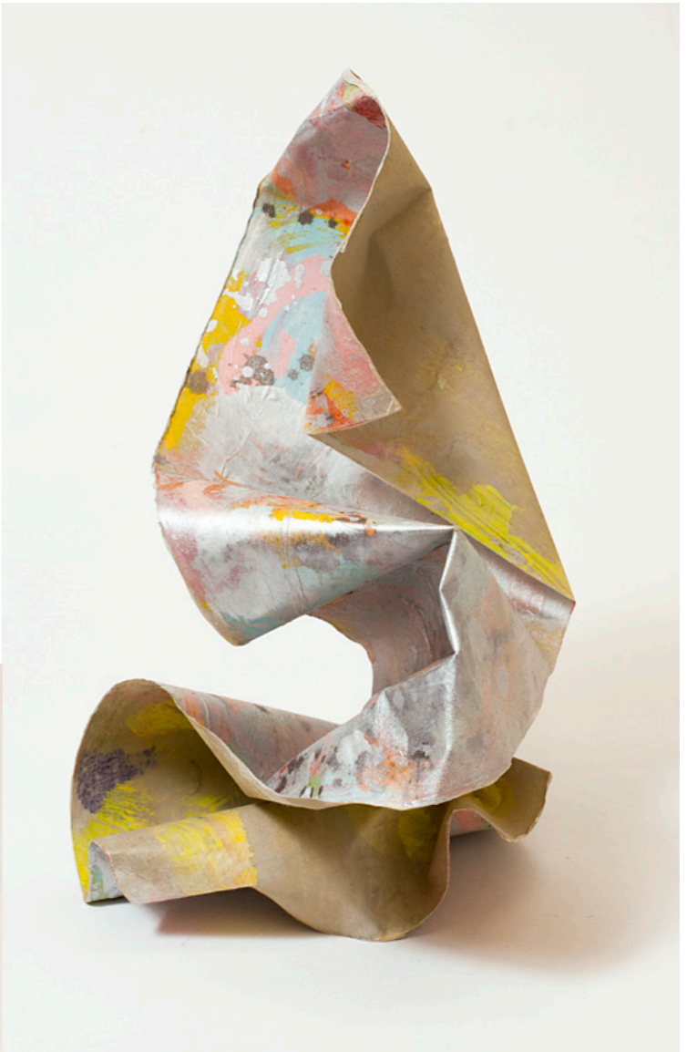
"uccello", 2013 11 x 17 x 12 in 27.9 x 43.1 x 30.4 cm acrylic and rice paper on aluminum