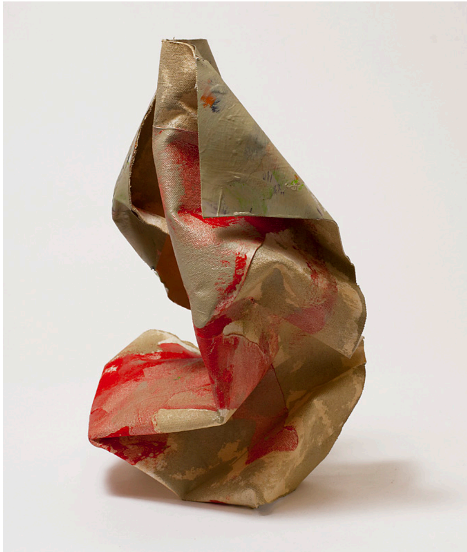
"petite oiseau", 2013 11.5 x 13.5 x 9 in 29.2 x 34.2 x 22.8 cm acrylic, paper, canvas and rice paper on aluminum