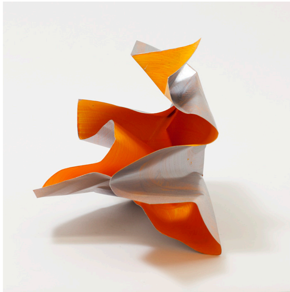
"silver bud", 2015 8 x 10.5 x 9 in 20.5 x 26 x 23 cm acrylic & alkaloid paint on aluminum