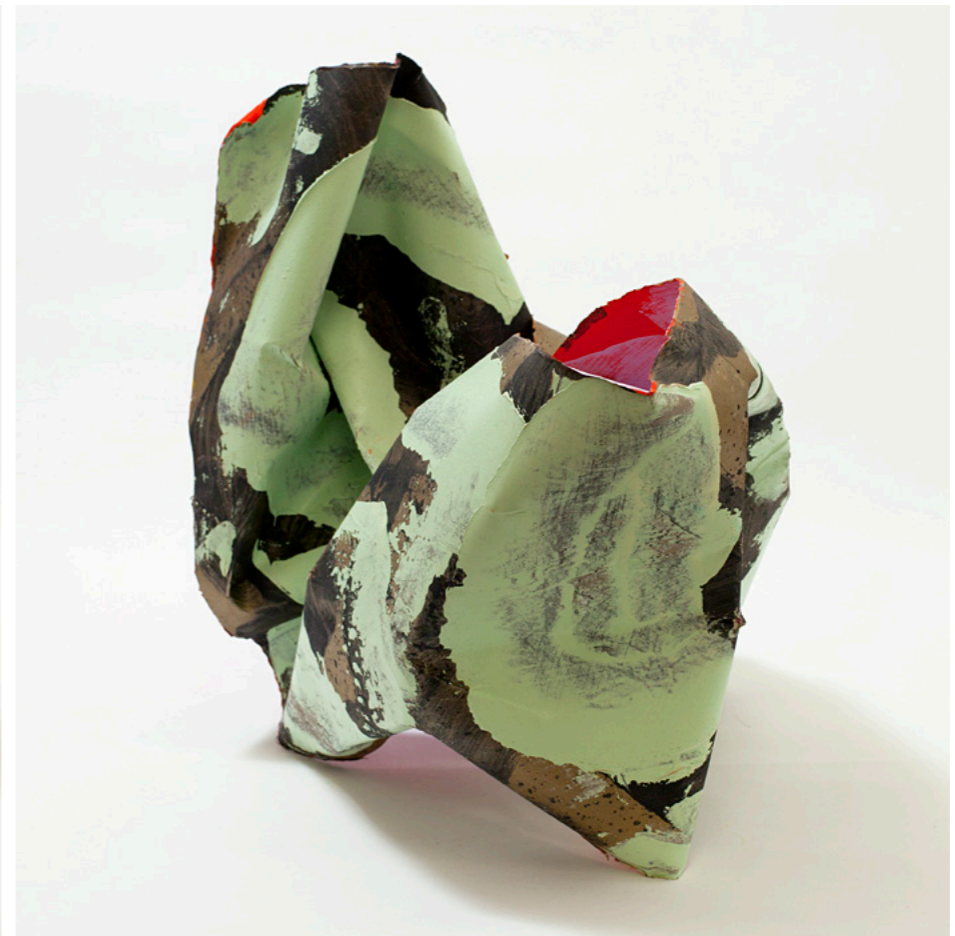
"meteor", 2015 18 x 27 x 14.5 in 45.5 x 68.5 x 37 cm acrylic and paper on aluminum